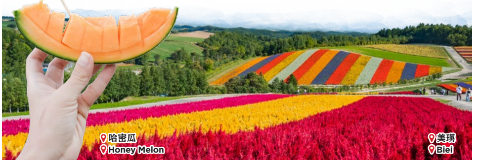
哈密瓜 Honey Melon