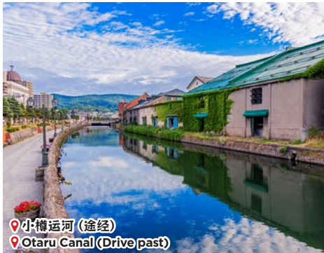
小樽运河 (途经) Otaru Canal (Drive past)