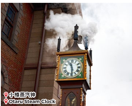
小樽蒸汽钟 Otaru Steam Clock