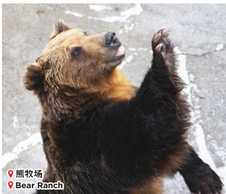
熊牧场 Bear Ranch