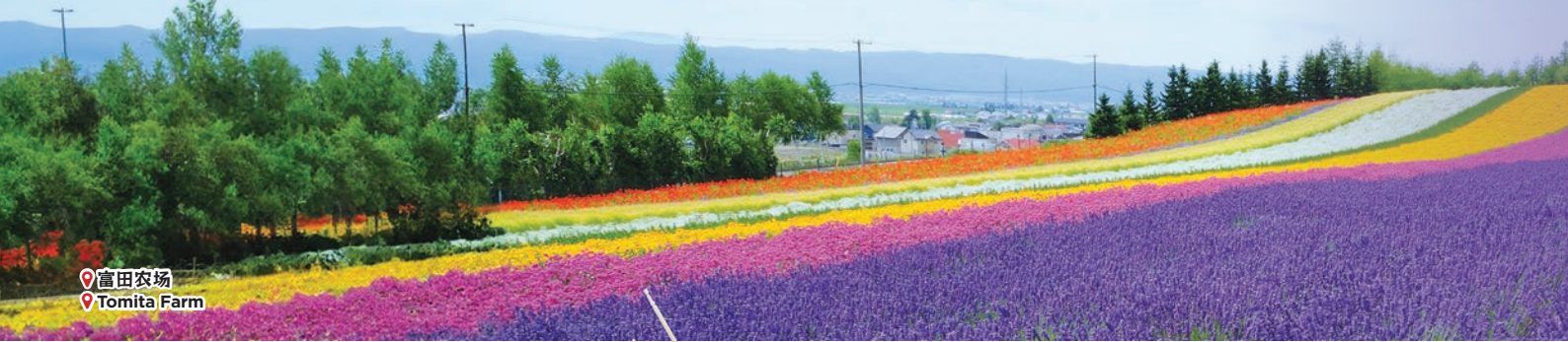
富田农场 Tomita Farm