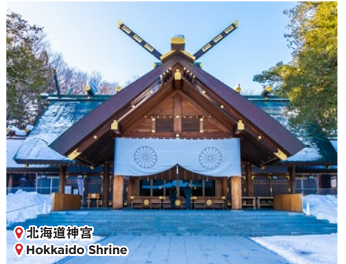
北海道神宫 Hokkaido Shrine