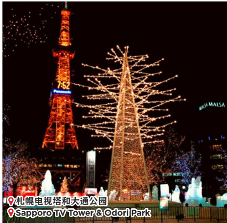
札幌电视塔和大通公园 Sapporo TV Tower & Odori Park