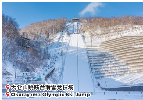
📍 大倉山跳躍台滑雪竞技场 Okurayama Olympic Ski Jump

After taking a domestic flight in Japan, take bus to a hotel near Narita/Kansai International Airport and stay for one night.