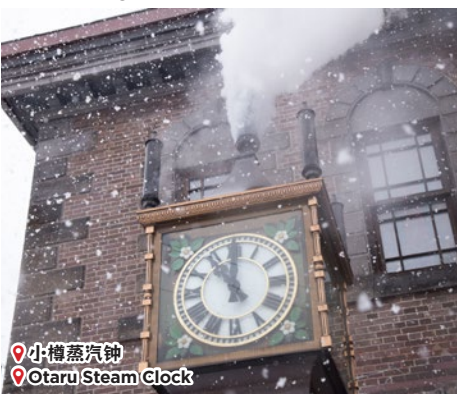
📍 小樽蒸汽钟 Otaru Steam Clock