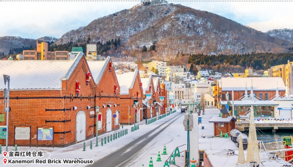
金森红砖仓库 Kanemori Red Brick Warehouse