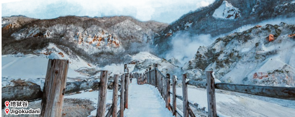
📍 地獄谷 Jigokudani