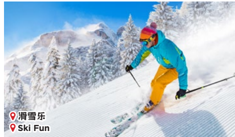
📍 滑雪乐 Ski Fun

Proceed to airport for your flight back home.