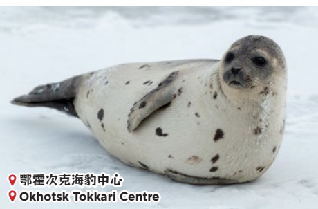
📍鄂霍次克海豹中心 📍Okhotsk Tokkari Centre

粉红色，白色，浅紫色等芝櫻如地毯般铺满公园，卉争斗丽，是北海道著名春季赏花景点。