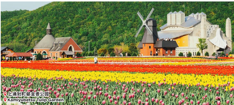
上涌别町郁金香公园 Kamiyubetsu Tulip Garden

SPRING ARRANGEMENT 🌸 Kamiyubetsu Tulip Park Admire up to 120 kinds of tulips in a sea of vibrant colours.