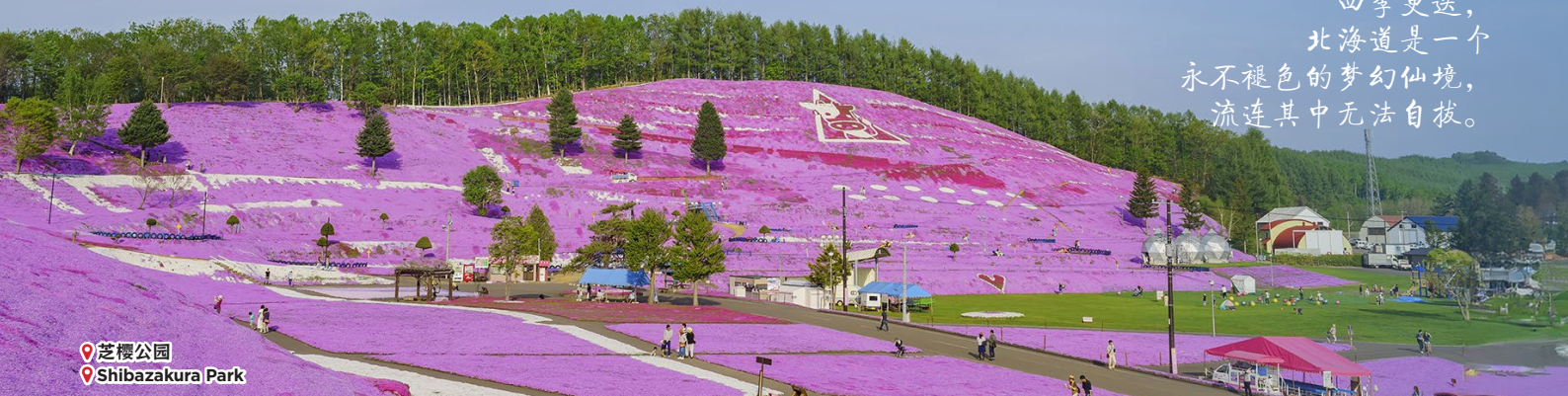
📍芝櫻公園 📍Shibazakura Park