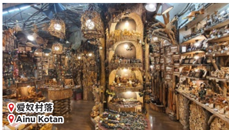
📍爱奴村落 📍Ainu Kotan