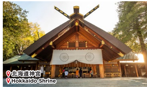
📍北海道神宮 📍Hokkaido Shrine