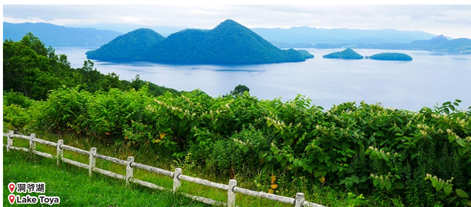
洞爷湖 Lake Toya