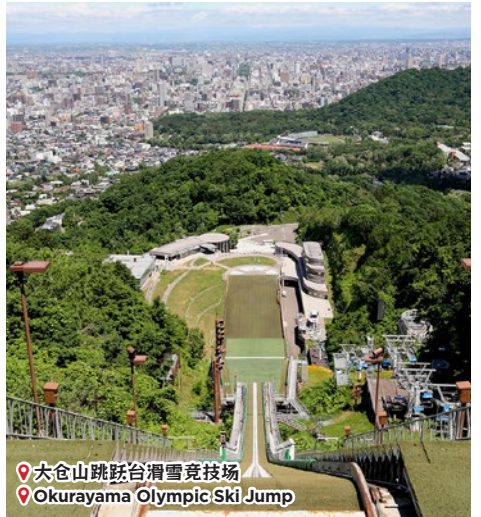
大倉山跳台滑雪竞技场 Okurayama Olympic Ski Jump

After taking a domestic flight in Japan, take bus to a hotel near Narita International Airport and stay for one night.