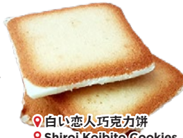
白い恋人巧克力饼 Shiroy Koibito Cookies