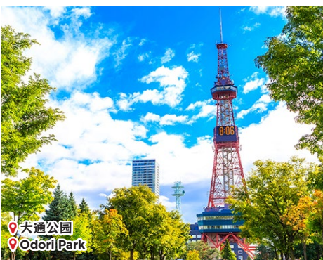
大通公園 Odori Park