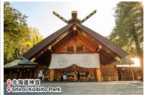
北海道神宫 Shirai Koibito Park