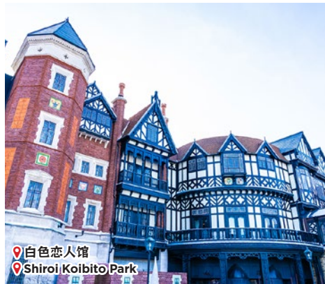
白色恋人馆 Shirai Koibito Park