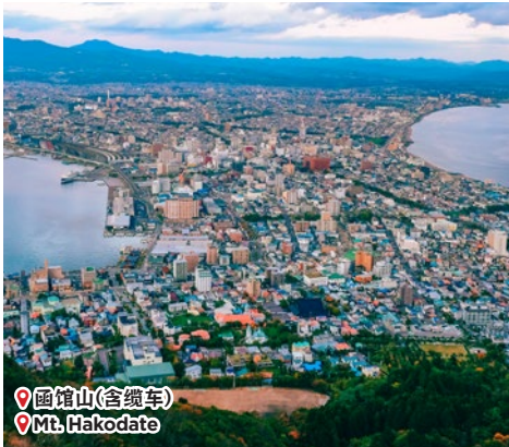
函館山(含缆车) Mt. Hakodate