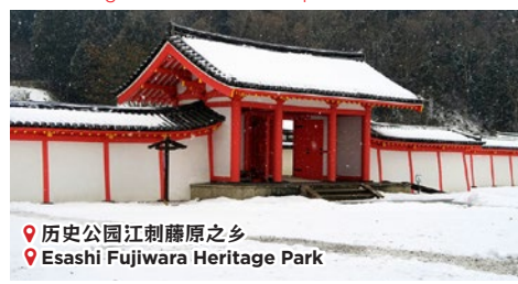
历史公园江刺藤原之乡 Esashi Fujiwara Heritage Park