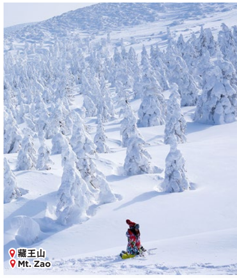
藏王山 Mt. Zao

📍 Tendo Hot Spring: Stay one night in an onsen resort and enjoy one of the oldest hot springs in Tohoku.