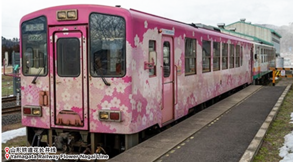
山形铁道花长井线 Yamagata Railway Flower Nagai Line

❄️ Weather conditions may affect natural wonders, leading to expected scenery not being available. In such cases, the planned itinerary will be followed. Your understanding is very much appreciated. ★ If cable cars or sightseeing boat are undergoing annual maintenance or have their operations halted due to weather or other force majeure factors, the itinerary will be changed or a refund will be provided.