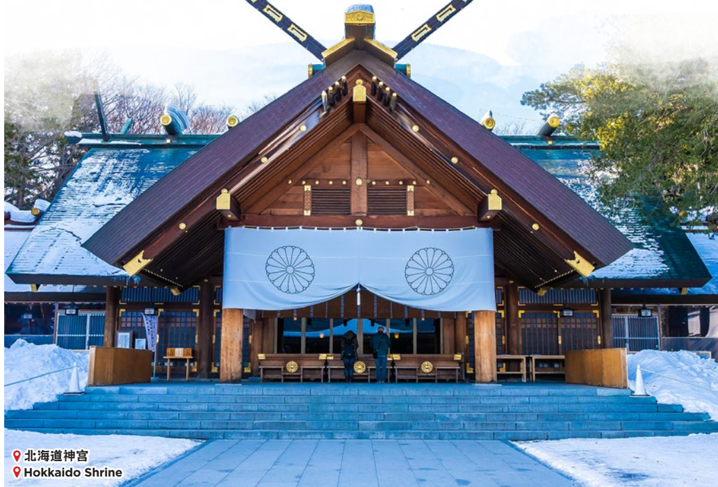
📍 北海道神宮 📍 Hokkaido Shrine