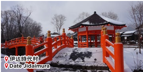
📍 伊達時代村 📍 Date Jidaimura