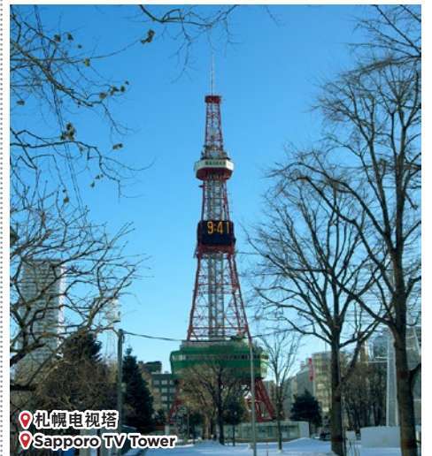
札幌电视塔 Sapporo TV Tower