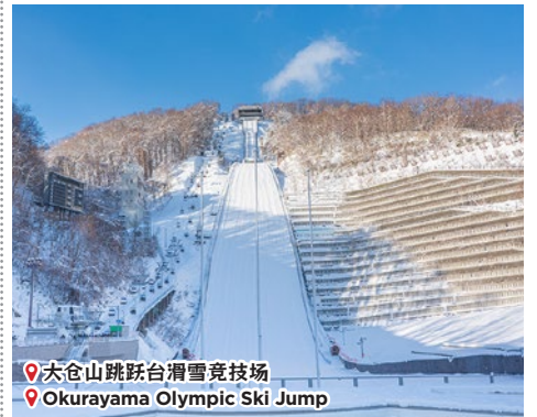
大仓山跳跃台滑雪竞技场 Okurayama Olympic Ski Jump