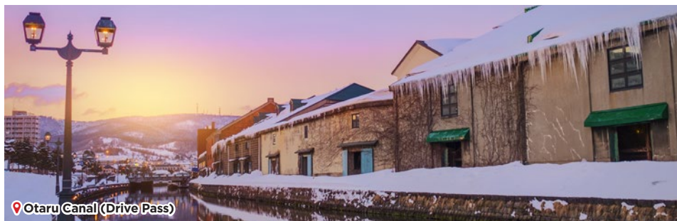
Otaru Canal (Drive Pass)

Proceed to the airport for your flight back home.