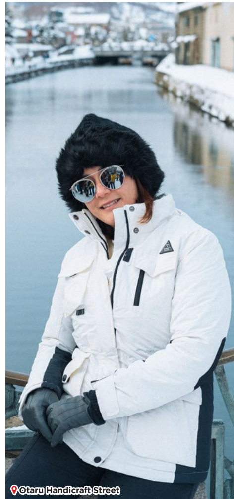
Otaru Handicraft Street