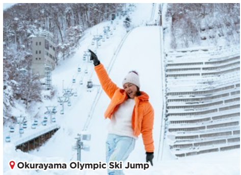
Okurayama Olympic Ski Jump

Branded Factory Outlet: Besides international brand, you can find local Japanese brand as well. From time to time, there will be added value promotions!