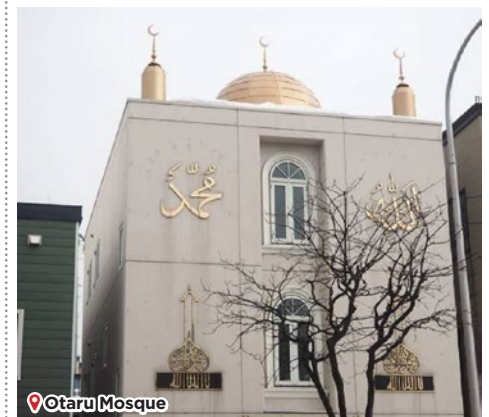
📍 Otaru Mosque