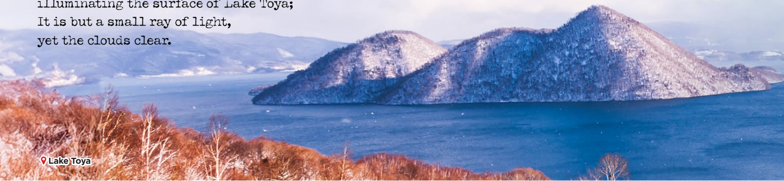
📍 Lake Toya

The sun shines through a break in the clouds, illuminating the surface of Lake Toya; It is but a small ray of light, yet the clouds clear.