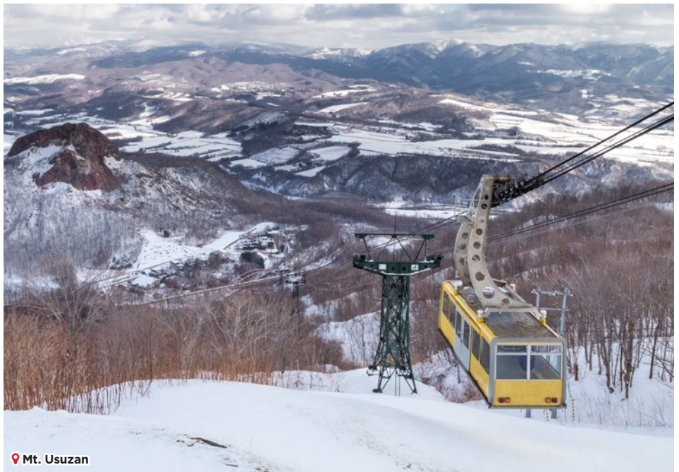
📍 Mt. Usuzan

📍 Noboribetsu Hot Spring: Stay one night in onsen resort and enjoy its hot springs that is well known in Hokkaido.