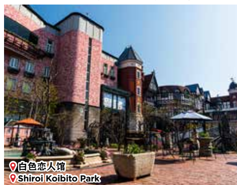
白色恋人馆 Shiroi Koibito Park