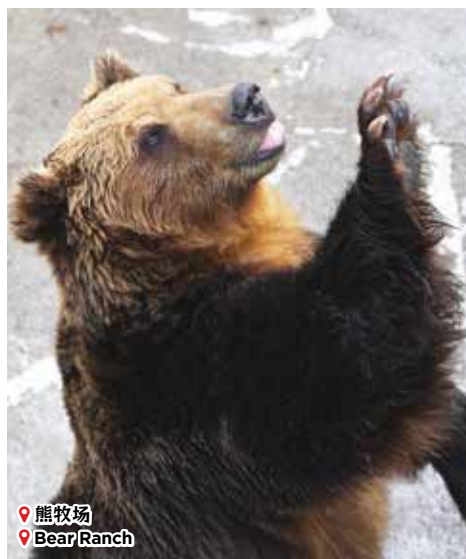
熊牧场 Bear Ranch