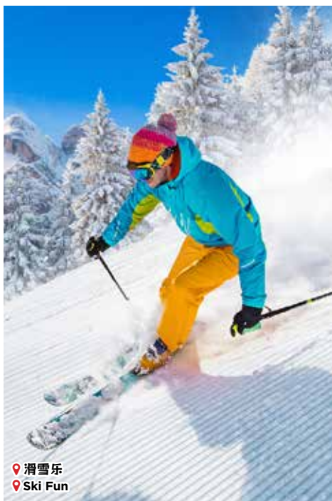
滑雪乐 Ski Fun