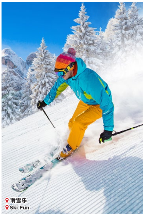
滑雪乐 Ski Fun