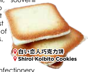
📍 白い恋人巧克力餅 📍 Shiroi Koibito Cookies