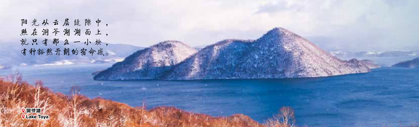
洞爷湖 Lake Toya

阳光从云层缝隙中， 照在洞爷湖湖面上， 就只有那么一小块， 有种豁然开朗的宿命感。