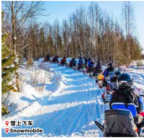
📍 雪上飞车 📍 Snowmobile