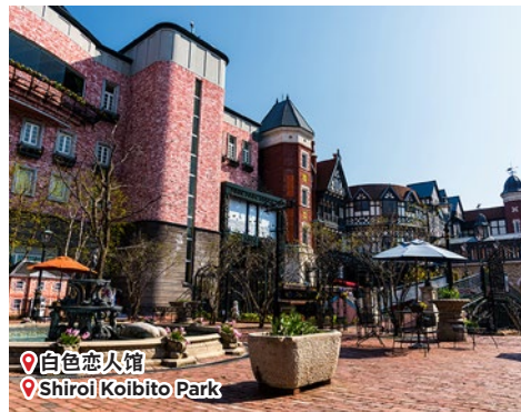
白色恋人馆 Shiroyoi Koibito Park