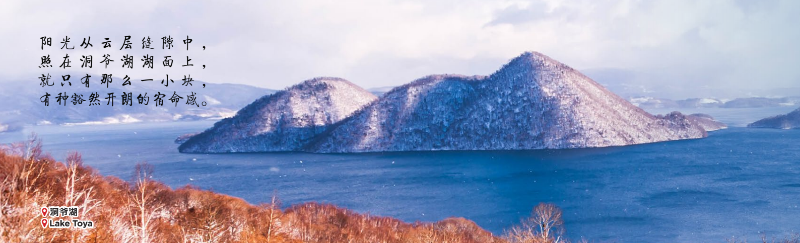
洞爷湖 Lake Toya

阳光从云层缝隙中， 照在洞爷湖湖面上， 就只有那么一小块， 有种豁然开朗的宿命感。