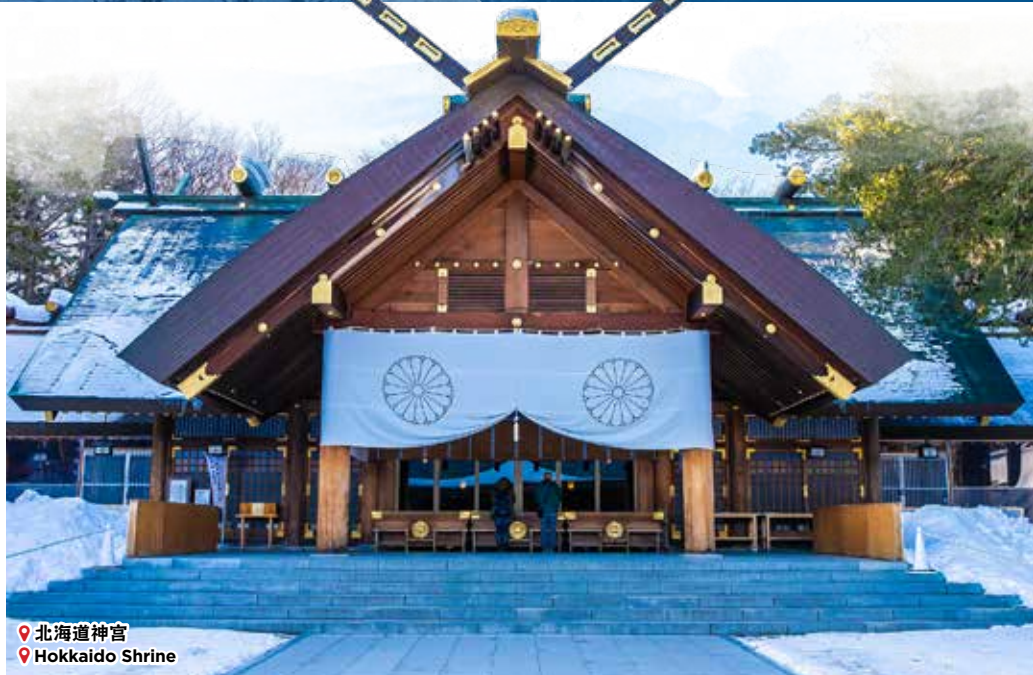
📍 北海道神宮 📍 Hokkaido Shrine