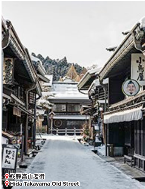
📍 飞騨高山老街 Hida Takayama Old Street

📍 Myozen-ji: This temple's highlight is the Shoromon Gate, which features a thatched roof and eye-catching beam carvings, making it a cultural treasure of Gifu Prefecture.