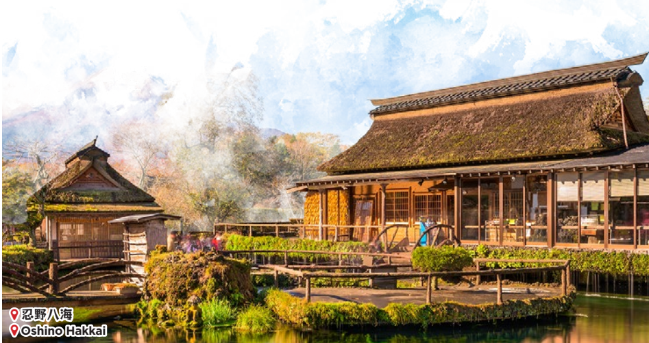
忍野八海 Oshino Hakkai