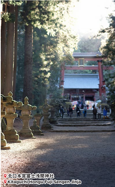
北口本宫富士浅间神社 Kitaguchi Hongu Fuji Sengen Jinja