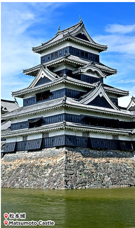
📍 松本城 Matsumoto Castle

📍 Matsumoto Castle: A national treasure and iconic landmark of Matsumoto City, Nagano Prefecture. Its unique five-story castle keep makes it a must-see attraction for history and architecture enthusiasts.