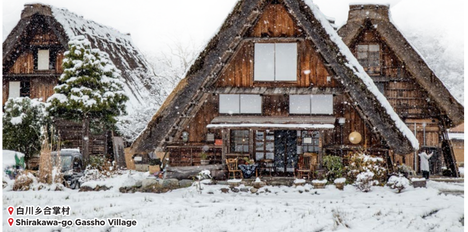
📍 白川郷合掌村 Shirakawa-go Gassho Village