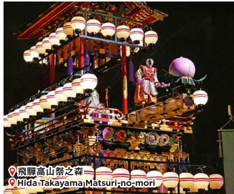
飞驒高山祭之森 Hida Takayama Matsuri-no-mori