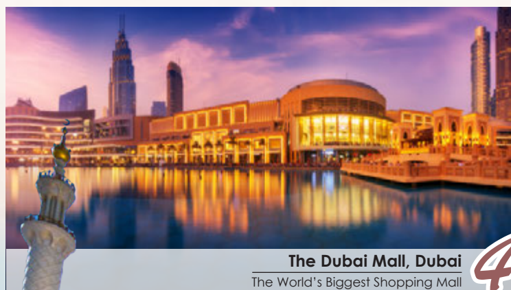
4 The Dubai Mall, Dubai The World's Biggest Shopping Mall