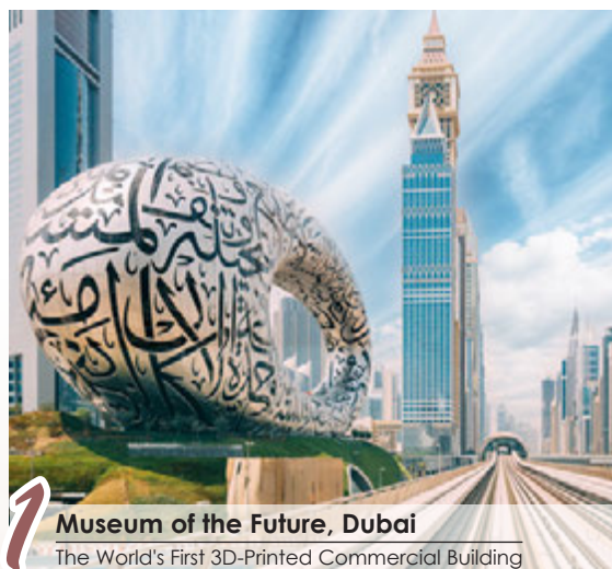
1 Museum of the Future, Dubai The World's First 3D-Printed Commercial Building