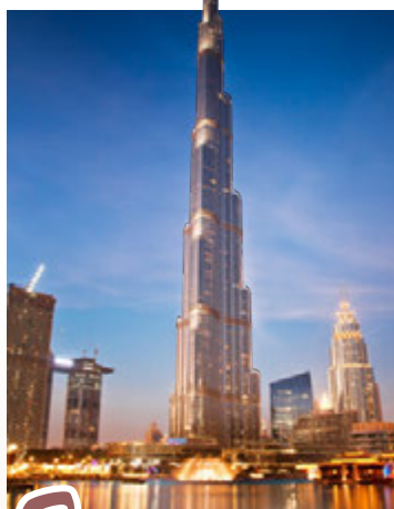
2 Burj Khalifa, Dubai The World's Tallest Building