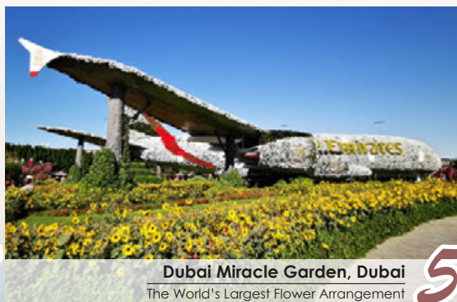
5 Dubai Miracle Garden, Dubai The World's Largest Flower Arrangement