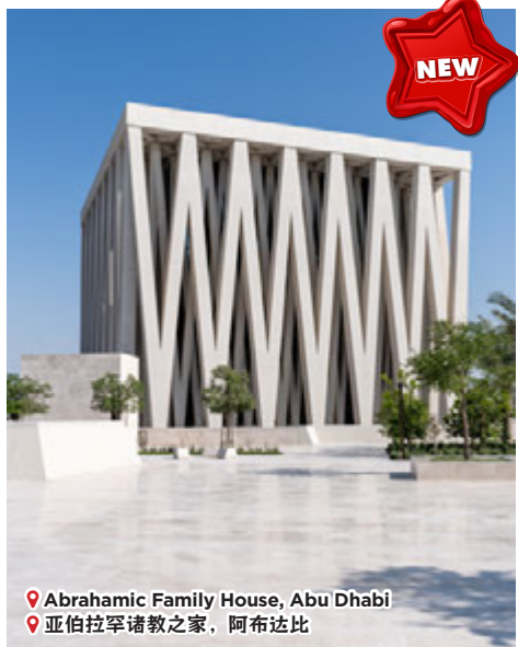
Abrahamic Family House, Abu Dhabi 亚伯拉罕诸教之家，阿布达比

(Optional Tour please refer to the last page)