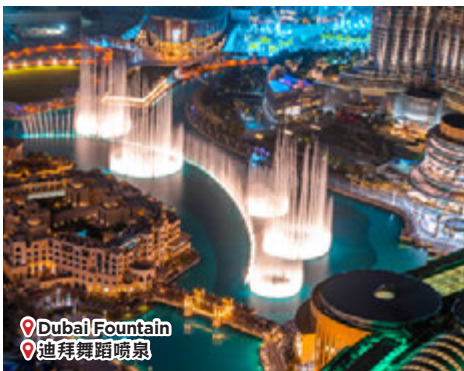
Dubai Fountain 迪拜舞蹈喷泉