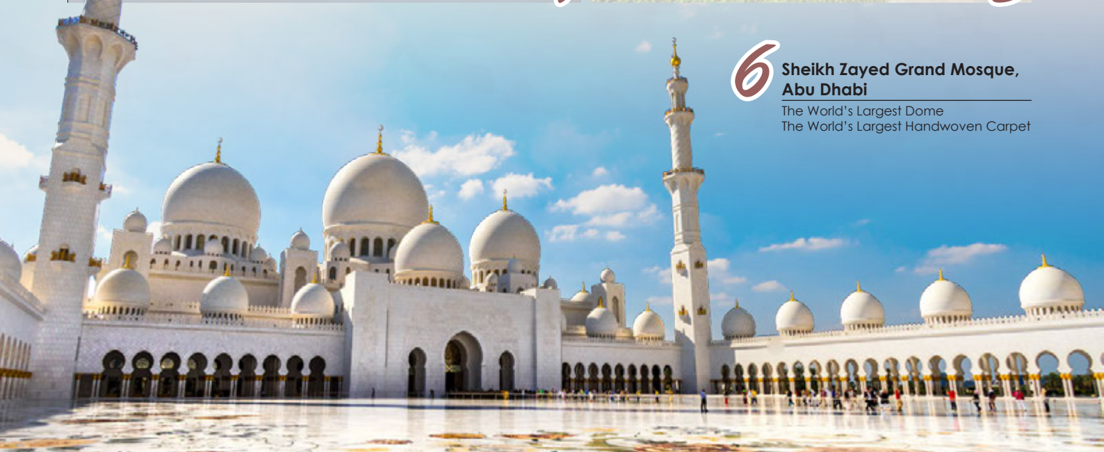
6 Sheikh Zayed Grand Mosque, Abu Dhabi The World's Largest Dome The World's Largest Handwoven Carpet