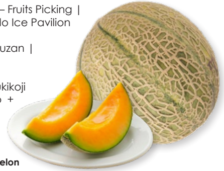
北海道蜜瓜 Hokkaido Melon

EXPERIENCE : Local specialties - Onsen | Pick and eat - Fruits Picking | -41°C extreme cold experience - Hokkaido Ice Pavilion ATTRACTIONS : Traverse to Edo period - Date Jidaimura | Hokkaido's largest national park - Daisetsuzan | Romantic town - Otaru | Famous Hokkaido Zoo - Asahiyama Zoo LEISURE : Sapporo's famous shopping district - Tanukikoji TASTE : Gala Seafood Lunch: Grilled King Crab + Abalone + Scallop | Ishikari Nabe Set + Sashimi + Hokke Cuisine | Hokkaido Famous Melon