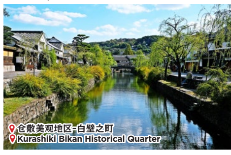
仓敷美观地区-白壁之町 Kurashiki Bikan Historical Quarter

Tottori Flower Gallery: Japan's largest flower theme park spans 50 hectares. Surrounding the floral area is a circular covered walkway where visitors can leisurely stroll.