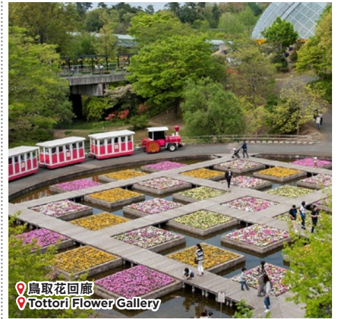
鳥取花回廊 Tottori Flower Gallery