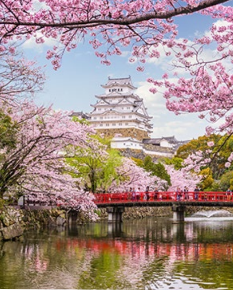
樱花季：3月下旬-4月上旬 Sakura Season: Late Mar - Early April