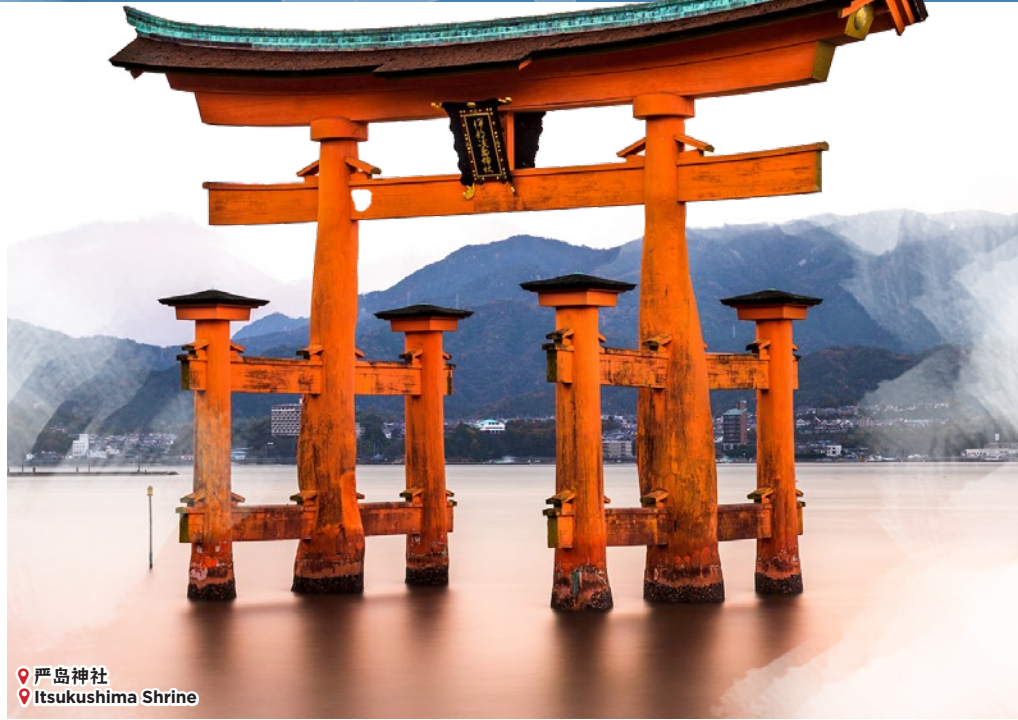
严岛神社 Itsukushima Shrine

Hiroshima Street: Shop from a variety of fashion stores, drug stores and department stores.