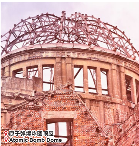
原子弹爆炸圆顶屋 Atomic Bomb Dome