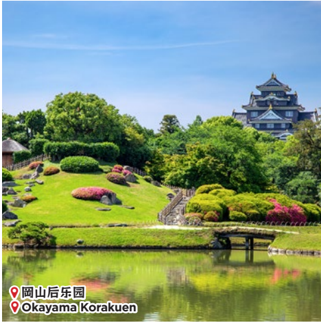
岡山后乐园 Okayama Korakuen

Okayama Korakuen: One of the Three Great Gardens of Japan besides Kenrokuen and Kairakuen, it was built in 1700 by Ikeda Tsunamasa, lord Okayama.