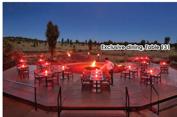
Table 131° Restaurant, Northern Territory

Longitude 131° is a luxury wilderness camp in Australia's Red Centre with modern design and eco-friendly concept. Longitude 131°'s Table 131° is renowned around the world as an iconic outdoor dining experience, with a menu prepared on a remote dune top under a glittering canopy of stars. With sounds of the Didgeridoo in the background, sip a glass of fine wine with your love one while enjoying the panoramic view of Ayers Rock slowly changes its colour as the sunsets. After dinner, the lodge guide offers a tour of the sky, sharing stories and legends of the stars alongside Aboriginal creation tales from the Red Centre.