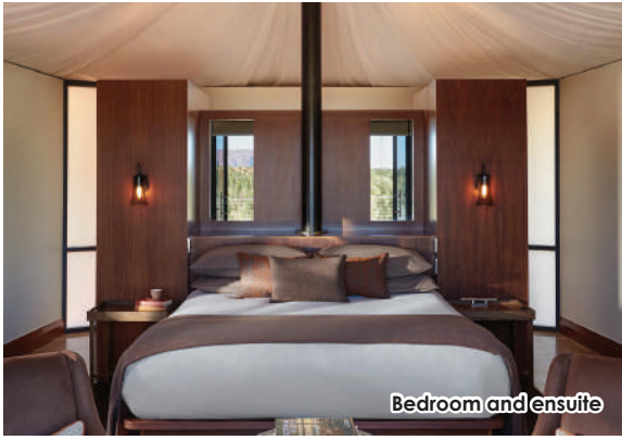
Bedroom and ensuite