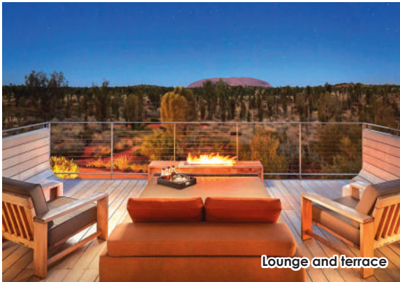
Lounge and terrace