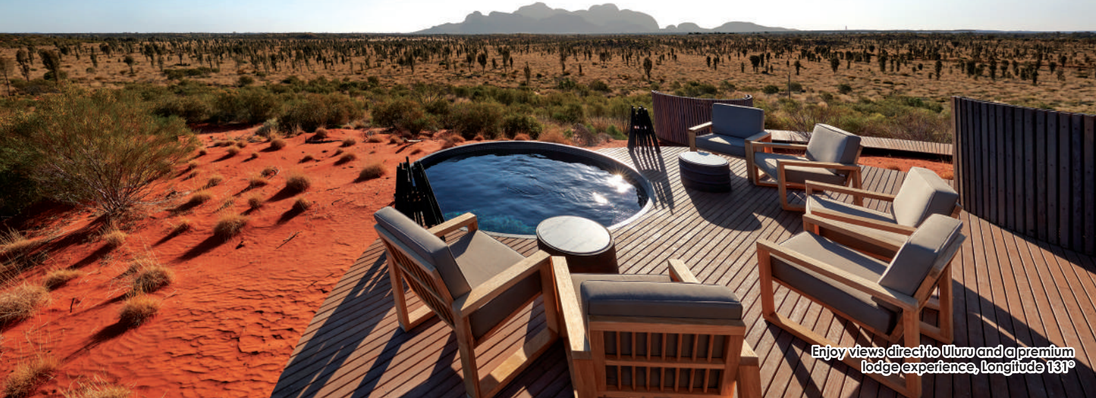
Enjoy views direct to Uluru and a premium lodge experience, Longitude 131°