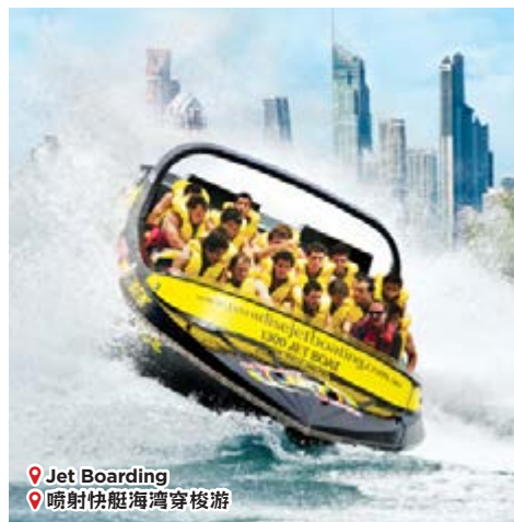
📍 Jet Boarding 📍 喷射快艇海湾穿梭游