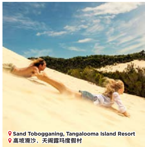
📍 Sand Tobogganing, Tangalooma Island Resort 📍 高坡滑沙, 天阁露玛度假村