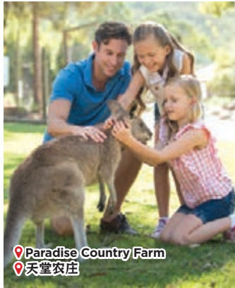
Paradise Country Farm 天堂农庄