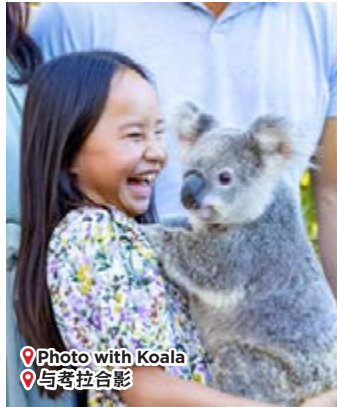
Photo with Koala 与考拉合影

*餐饮与酒店会随着季节与当时情况, 作最适当的调整。*Meals & hotels above are subject to change without prior notice.