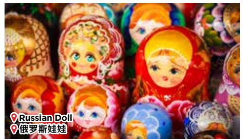
Russian Doll 俄罗斯娃娃