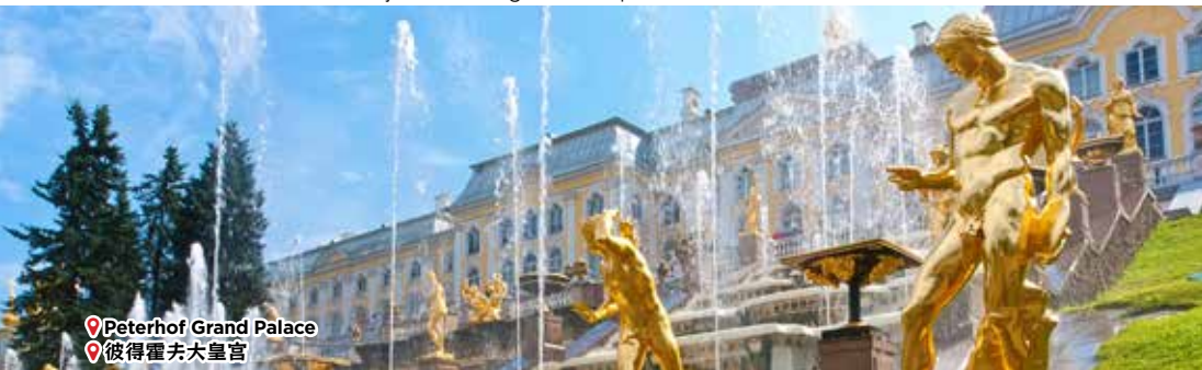
📍 Peterhof Grand Palace 📍 彼得霍夫大皇宫

*Meals & hotels above are subject to change without prior notice.