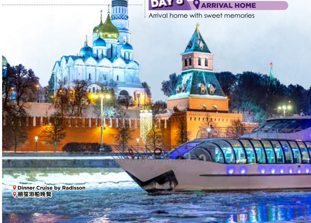
Dinner Cruise by Radisson 丽笙游船晚餐

After that, board the high-speed SAPSAN train (Business Class) to St. Petersburg for 4 hours.