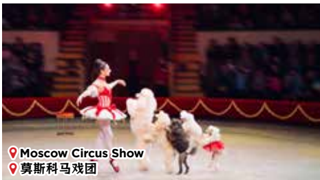
Moscow Circus Show 莫斯科马戏团

Continue to enjoying the fascinating world-famous Great Moscow Circus Show to complete the day.