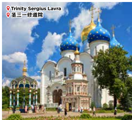
Trinity Sergius Lavra 圣三一修道院

Tonight, have a hearty dinner with a spectacular view of Moscow on Radisson Cruise , sailing along Moskva River.