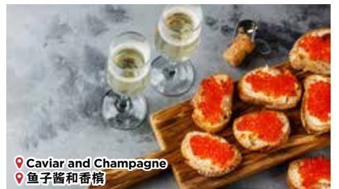
Caviar and Champagne 鱼子酱和香槟