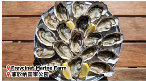
Freycinet Marine Farm 菲欣纳国家公园

*餐饮与酒店会随着季节与当时情况, 作最适当的调整。 *Meals & hotels above are subject to change without prior notice.