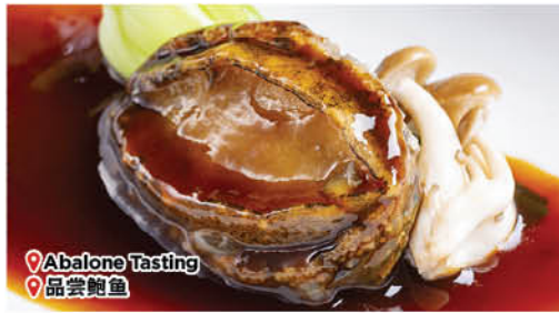
Abalone Tasting 品尝鲍鱼