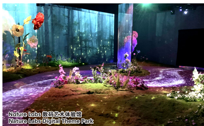
Nature Labs 数码艺术体验馆 Nature Labs Digital Theme Park