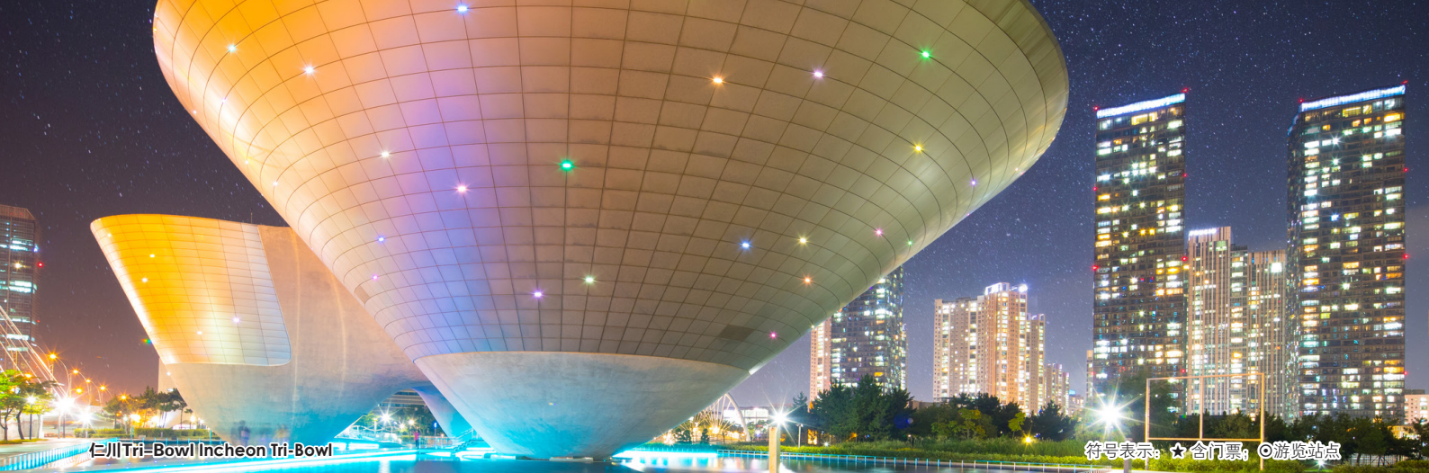
仁川Tri-Bowl Incheon Tri-Bowl