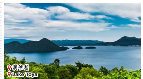
📍 洞爷湖 📍 Lake Toya

● Above seasonal & special arrangement date base on Departure Date.