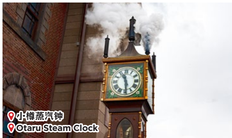
📍 小樽蒸汽钟 📍 Otaru Steam Clock

📍 Tanukikoji Shopping Arcade : Have fun shopping at more than 150 outlets offering products ranging from souvenirs and clothes to cafes and snacks. Drive past Susukino , Sapporo's most famous nightlife and entertainment area.