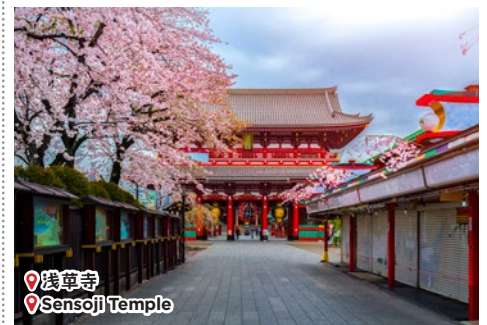
📍 浅草寺 📍 Sensoji Temple

Visit the famous and popular park for Cherry Blossom Festival.