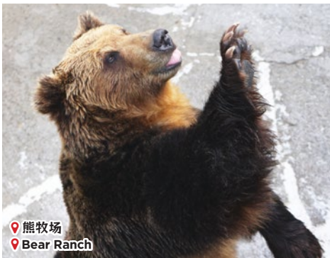
📍 熊牧场 📍 Bear Ranch

📍 Bear Ranch : You can feed the Hokkaido brown bears with apples or cookies.