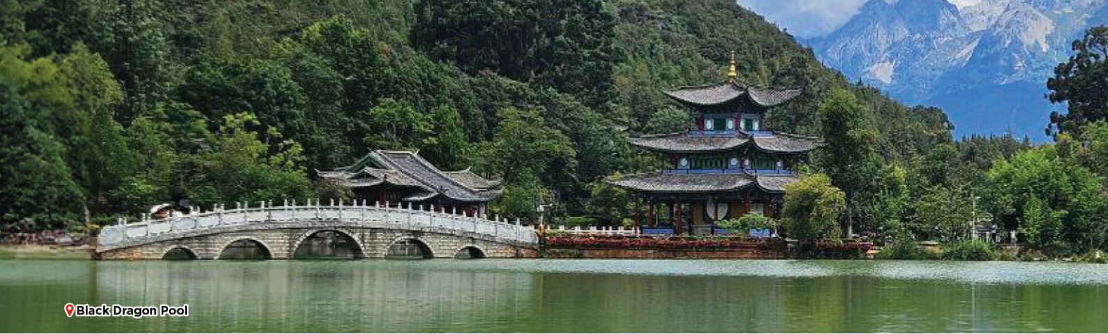
📍 Black Dragon Pool