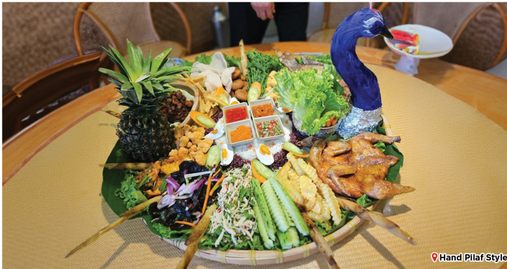
Hand Pilaf Style

*Meals & hotels above are subject to change without prior notice.