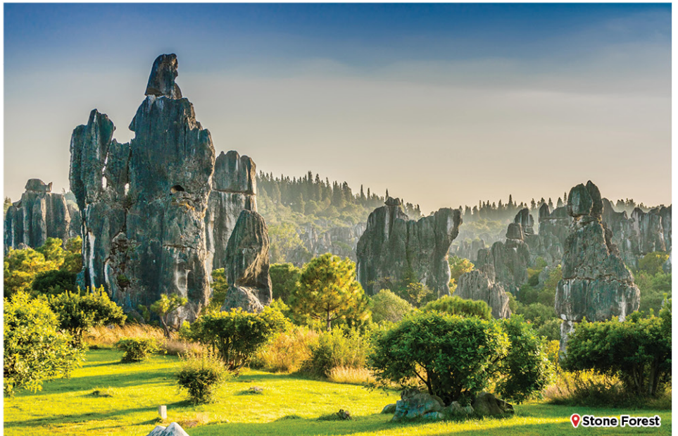
📍 Stone Forest