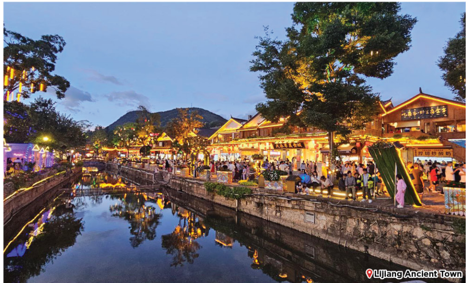
📍 Lijiang Ancient Town