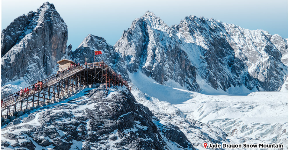
📍 Jade Dragon Snow Mountain