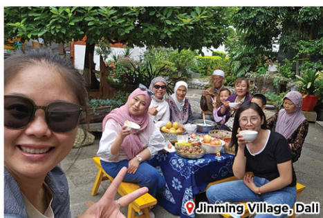
📍 Jinming Village, Dali