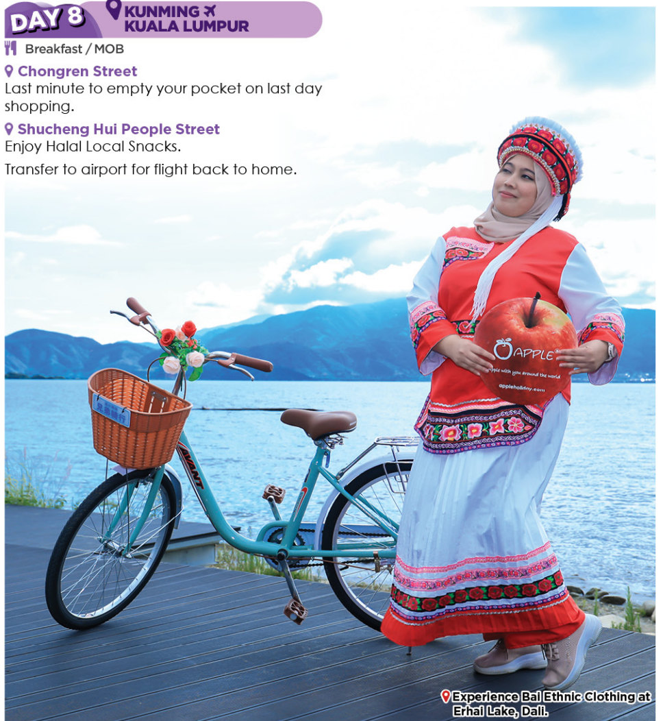
📍 Experience Bai Ethnic Clothing at Erhai Lake, Dali.

Transfer to airport for flight back to home.