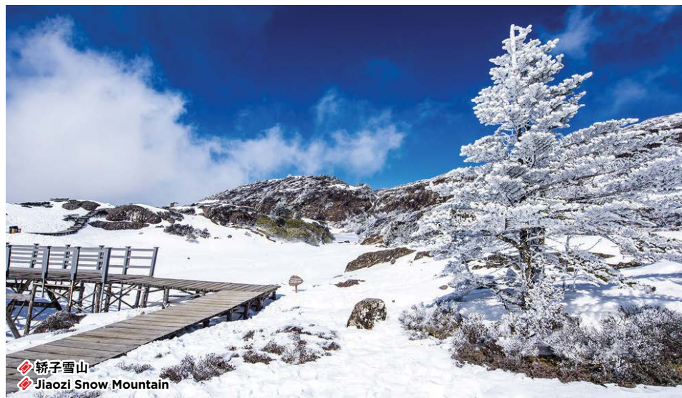
轿子雪山 Jiaozi Snow Mountain