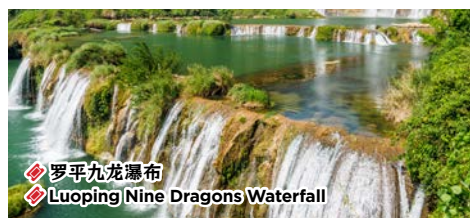
◆ 罗平九龙瀑布 ◆ Luoping Nine Dragons Waterfall