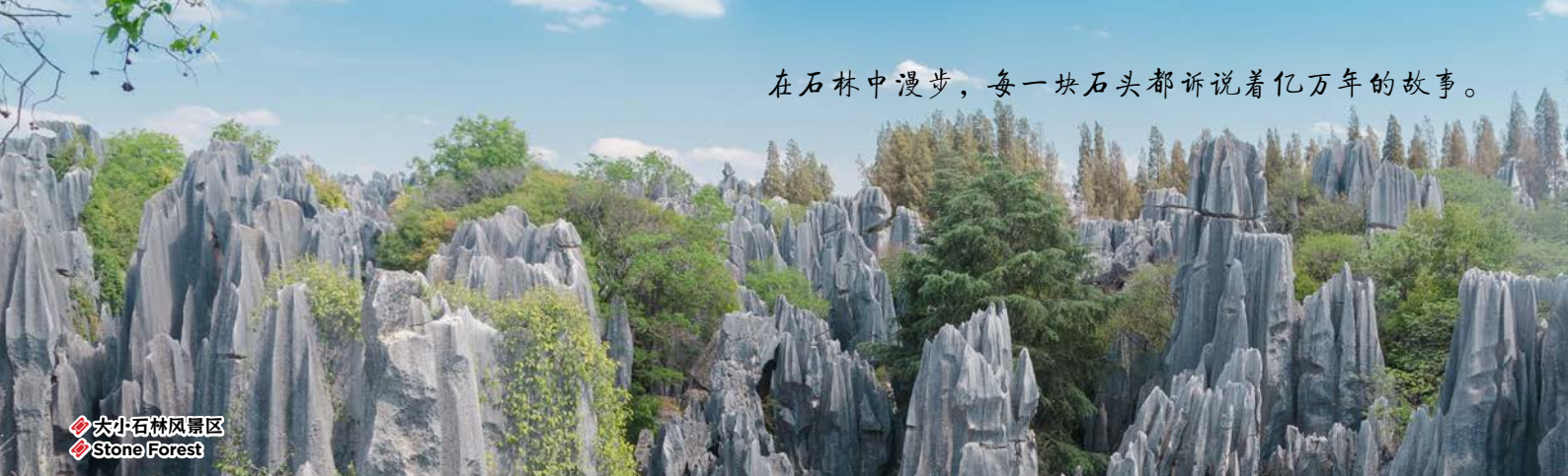
大石林风景区 Stone Forest