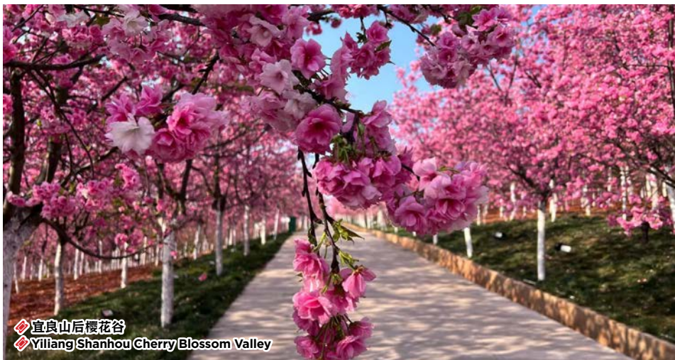
◆ 宜良山后樱花谷 ◆ Yiliang Shanhou Cherry Blossom Valley