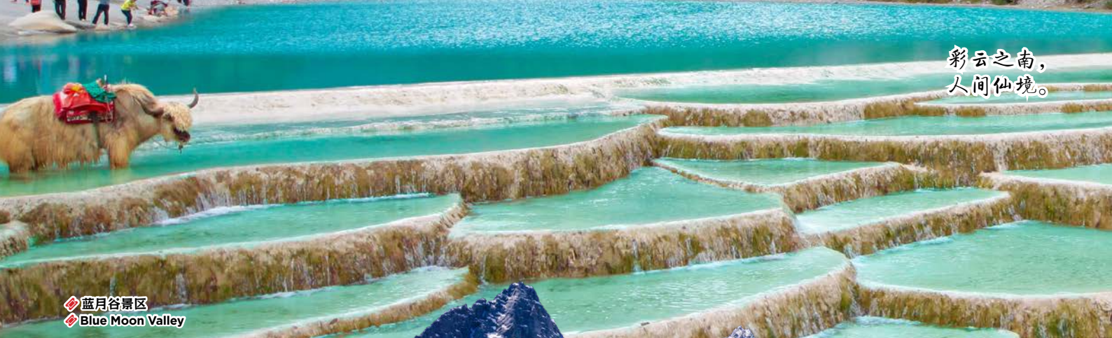
蓝月谷景区 Blue Moon Valley