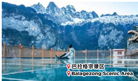
巴拉格宗景区 Balagezong Scenic Area