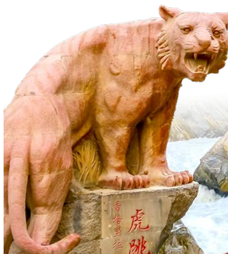
虎跳峡 Tiger Leaping Gorge

The largest and best-preserved Tibetan city among the 147 Tibetan counties in China, it serves as a vital hub along the ancient Tea Horse Road and a significant focal point for Han-Tibetan cultural exchange.