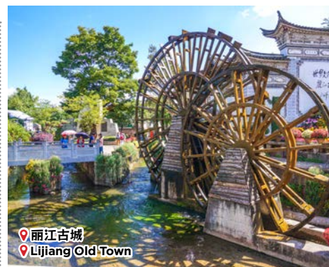
丽江古城 Lijiang Old Town