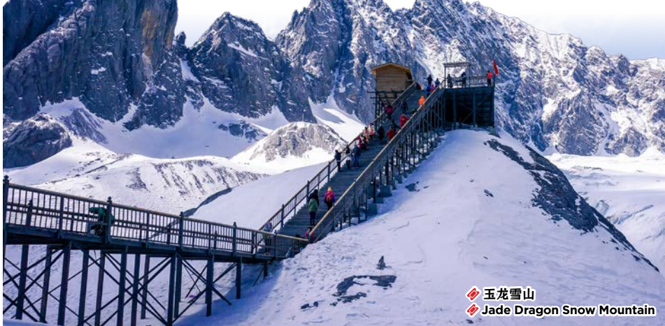
玉龙雪山 Jade Dragon Snow Mountain