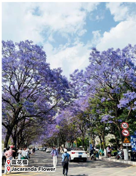
蓝花楹 Jacaranda Flower