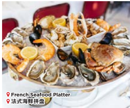
French Seafood Platter 法式海鲜拼盘