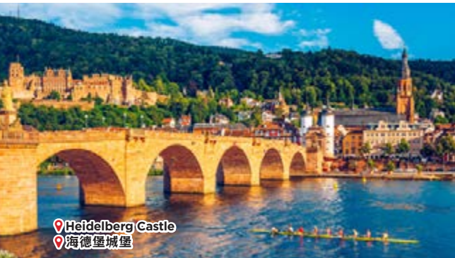
Heidelberg Castle 海德堡城堡

*餐饮与酒店会随着季节与当时情况，作最适当的调整。*Meals & hotels above are subject to change without prior notice.