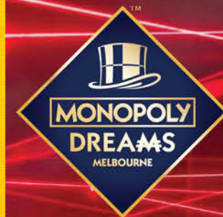
Monopoly Dreams 大富翁梦想世界