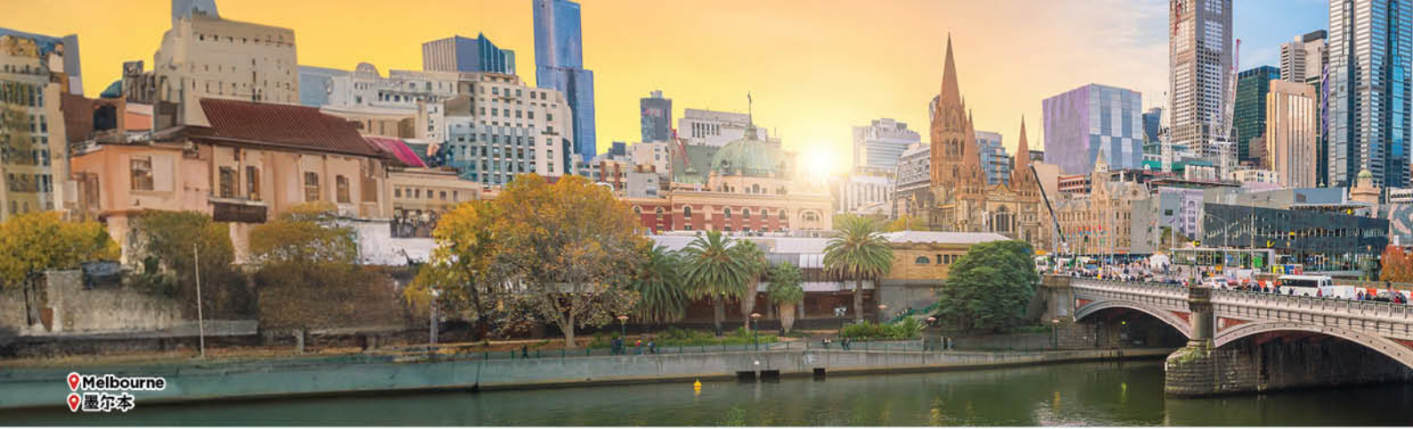
📍 Melbourne 📍 墨尔本