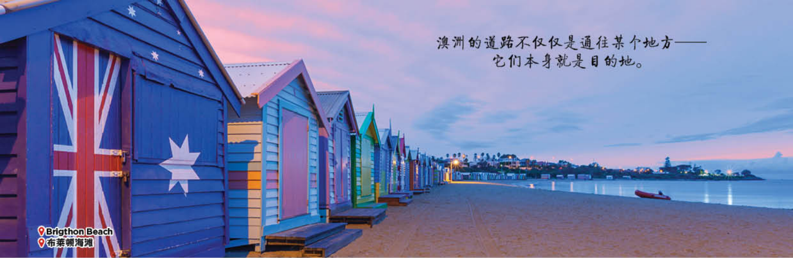
Brighon Beach 布莱顿海滩