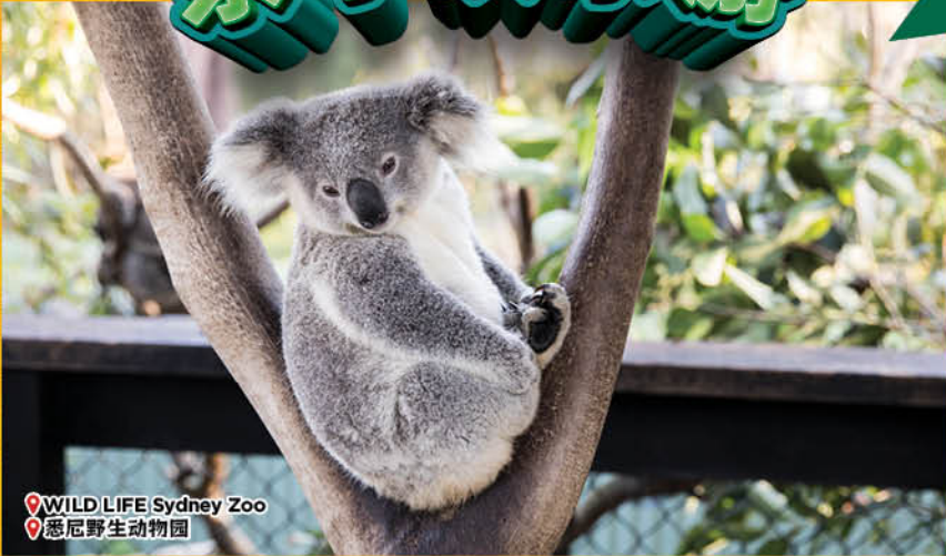
WILD LIFE Sydney Zoo 悉尼野生动物园

在澳大利亚最著名的城市：悉尼、堪培拉和墨尔本，与朋友和家人一起体验各种有趣景点和好玩活动吧！