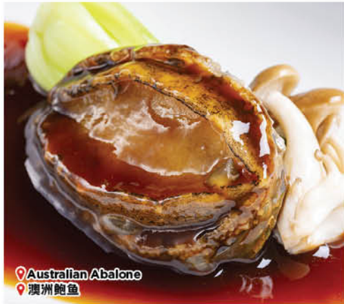
Australian Abalone 澳洲鲍鱼

*餐饮与酒店会随着季节与当时情况, 作最适当的调整。*Meals & hotels above are subject to change without prior notice.