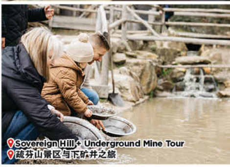
Sovereign Hill + Underground Mine Tour 疏芬山景区与下矿井之旅