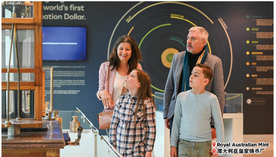
📍 Royal Australian Mint 📍 澳大利亚皇家铸币厂