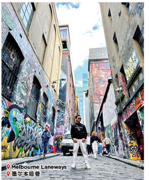
Melbourne Laneways 墨尔本后巷