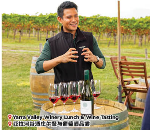
Yarra Valley Winery Lunch & Wine Tasting 亚拉河谷酒庄午餐与葡萄酒品尝