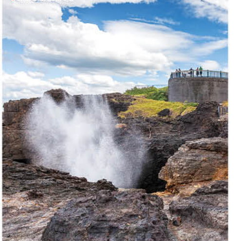
Kiama Blowhole 凯阿马喷水洞