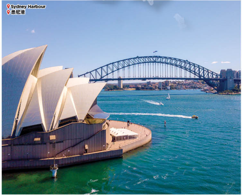
Sydney Harbour 悉尼港