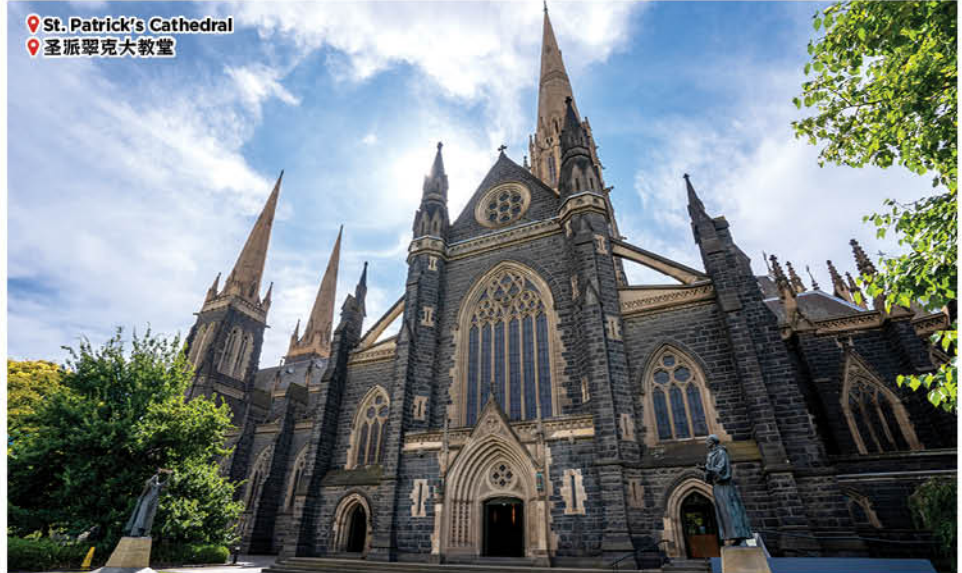
St. Patrick's Cathedral 圣派翠克大教堂