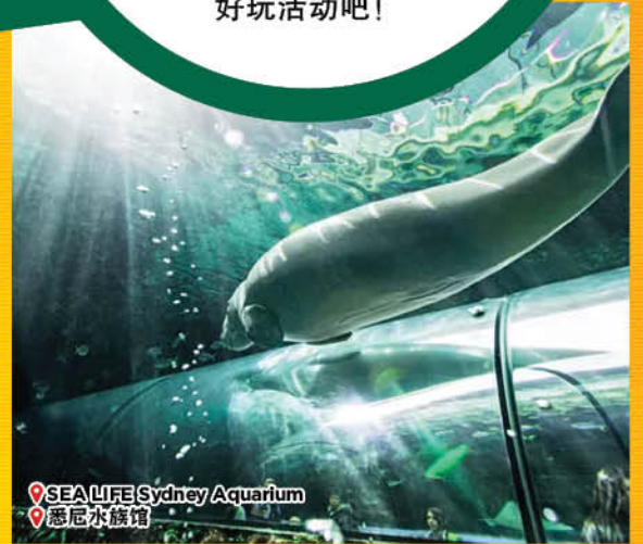
SEA LIFE Sydney Aquarium 悉尼水族馆