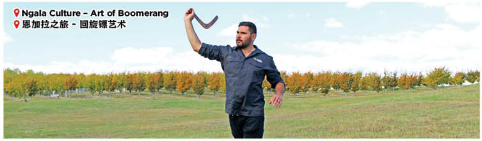
Ngala Culture - Art of Boomerang 恩加拉之旅 - 回旋镖艺术