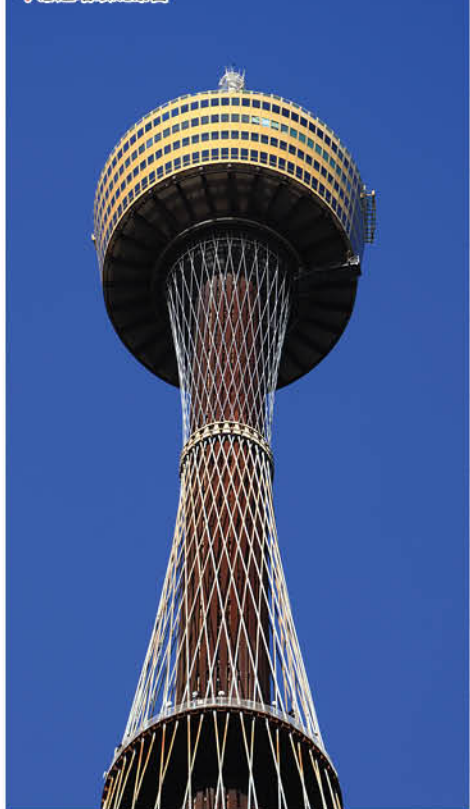
Sydney Tower Eye Observation Deck 悉尼塔眼观景台

在闻名世界的悉尼鱼市场品尝令人垂涎的新鲜海鲜。您可在此采购喜欢的海产，或边享用午餐边感受热闹的码头氛围。然后，参观悉尼塔眼观景台，欣赏超过80公里的全景视野。