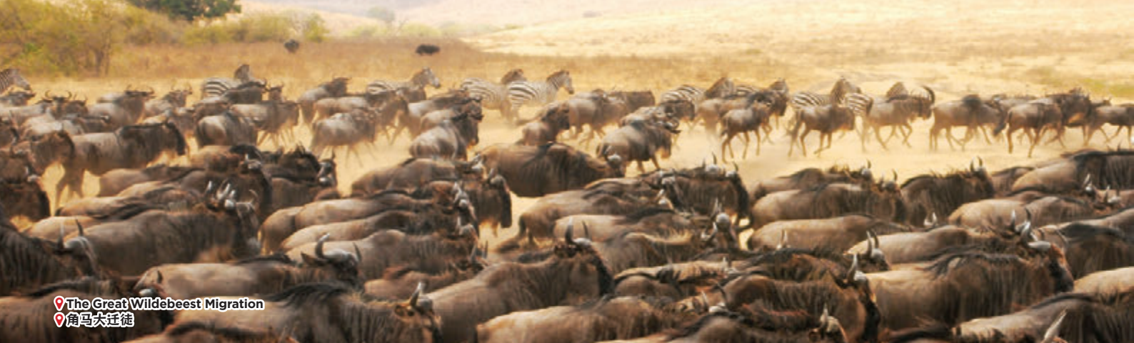
📍 The Great Wildebeest Migration 📍 角马大迁徙