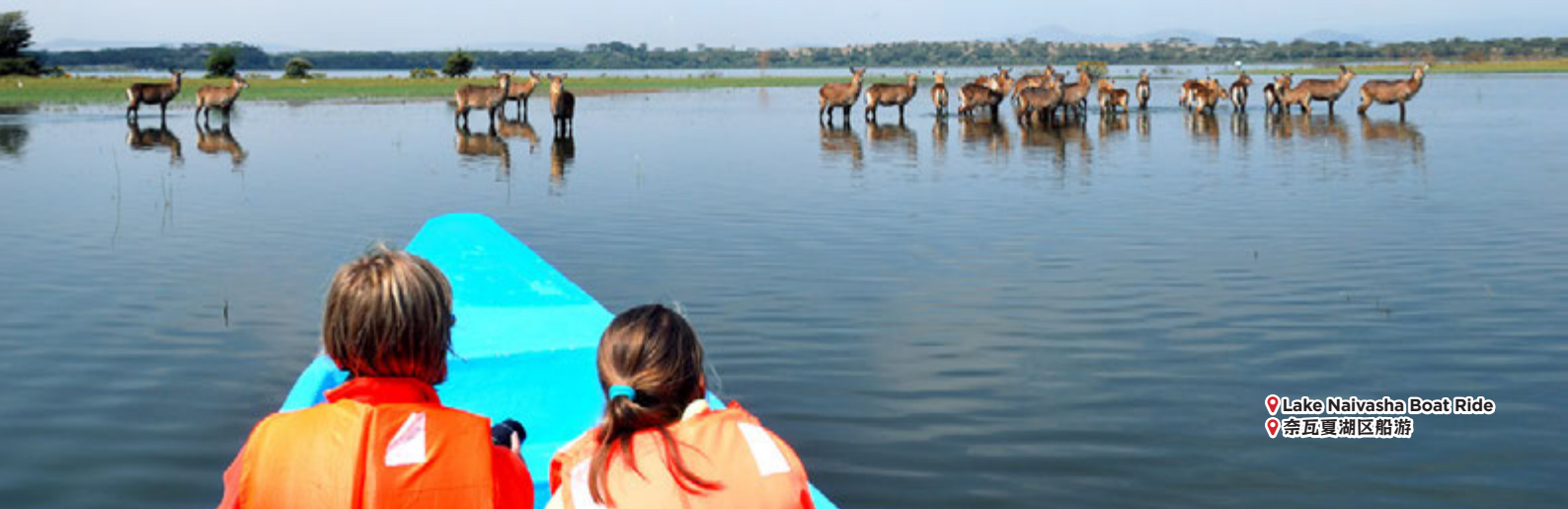
📍 Lake Naivasha Boat Ride 📍 奈瓦夏湖区船游

Upon arrival, transfer to the Superior Tented Camp in Maasai Mara National Reserve . Enjoy your dinner and spend the rest of the night at the camp which sits on the pre-historical land of 25 million years.