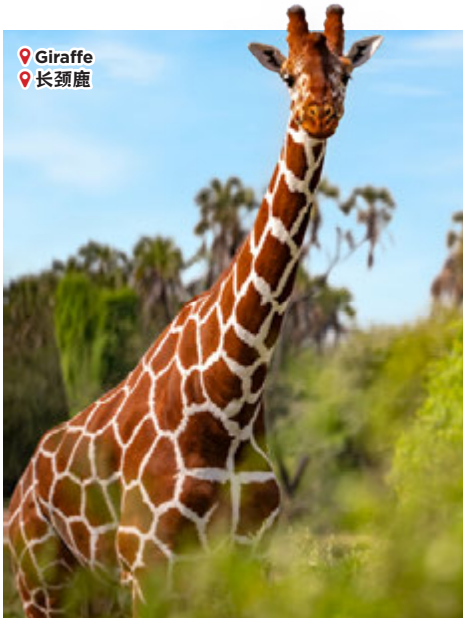
📍 Giraffe 📍 长颈鹿