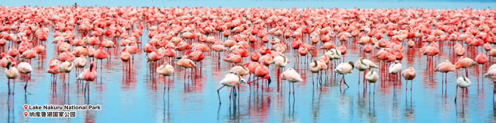
📍 Lake Nakuru National Park 📍 纳库鲁国家公园