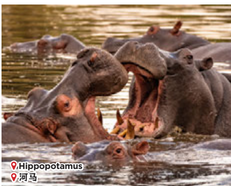
📍 Hippopotamus 📍 河马

Today, there will be 2 Sessions Of Super Jeep Game Safari that takes you to vantage points to witness this great phenomenon that you can't find anywhere in the world. Be braced for some spectacular predatory action live!