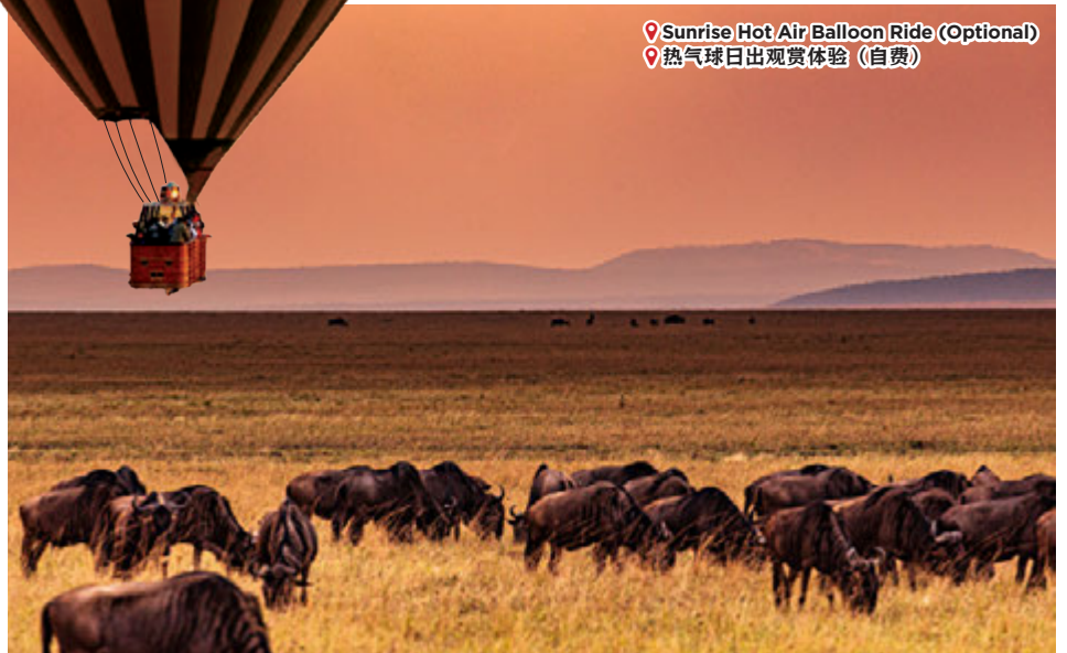
📍 Sunrise Hot Air Balloon Ride (Optional) 📍 热气球日出观赏体验 (自费)