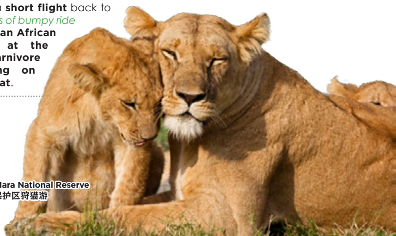
📍 Game Drive in Maasai Mara National Reserve 📍 马赛马拉国家野生动物保护区狩猎游