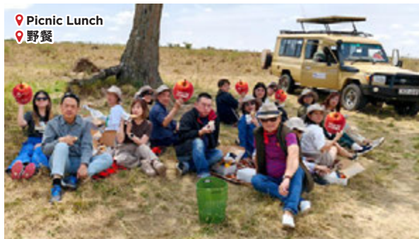
Picnic Lunch 野餐

*餐饮与酒店会随着季节与当时情况，作最适当的调整。*Meals & hotels above are subject to change without prior notice.