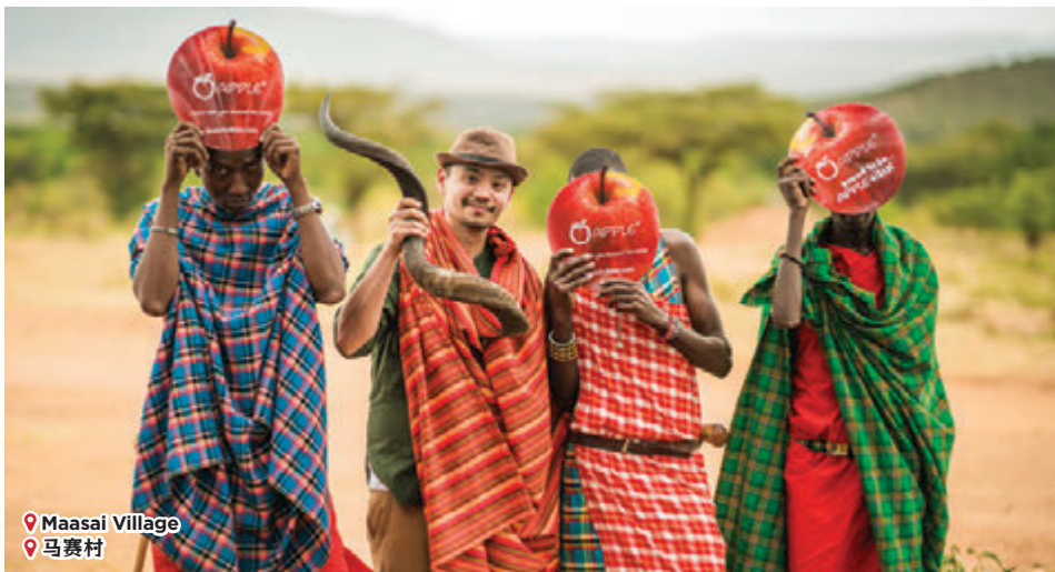
📍 Maasai Village 📍 马赛村