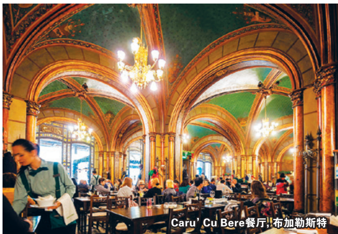
Caru' Cu Bere餐厅，布加勒斯特