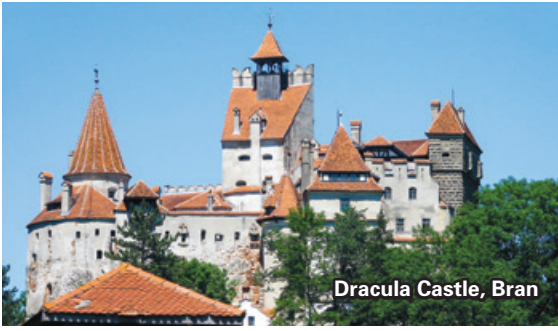
Dracula Castle, Bran