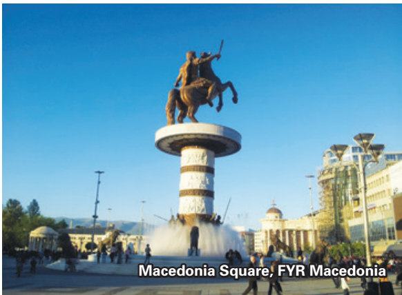
Macedonia Square, FYR Macedonia