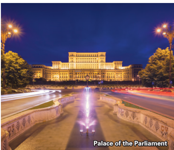
Palace of the Parliament