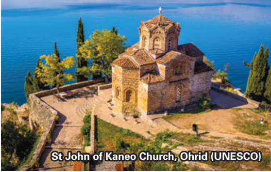
St John of Kaneo Church, Ohrid (UNESCO)