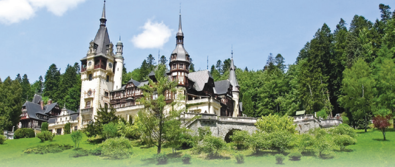
Peles Castle, Sinaia