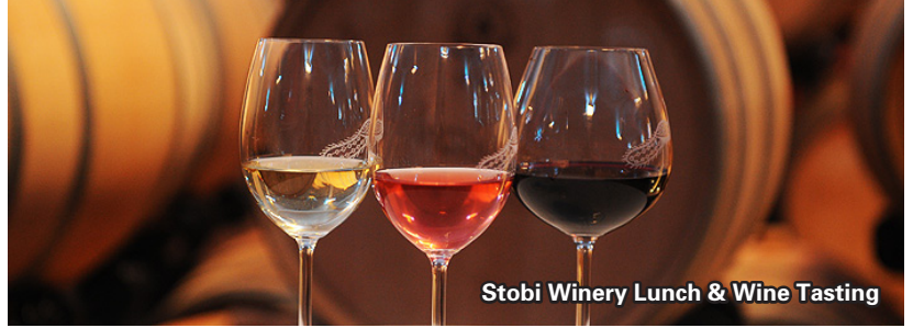
Stobi Winery Lunch & Wine Tasting