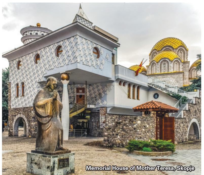
Memorial House of Mother Teresa, Skopje