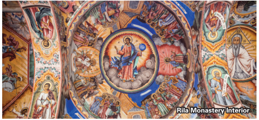
Rila Monastery Interior