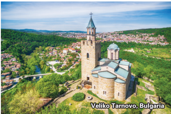
Veliko Tarnovo, Bulgaria