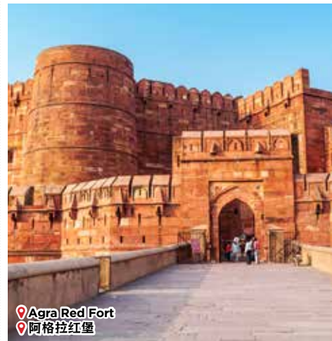
📍 Agra Red Fort 📍 阿格拉红堡

A witness to the tides of history, from the Mughals to the British and finally the birth of India's independence.