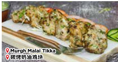
📍 Murgh Malai Tikka 📍 碳烤奶油鸡块