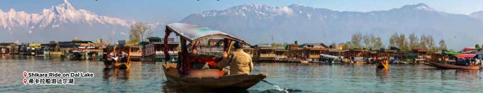
📍 Shikara Ride on Dal Lake 📍 希卡拉船游达尔湖

We live in a wonderful world that is full of beauty, charm and adventure. There is no end to the adventures we can have if only we seek them with our eyes open.