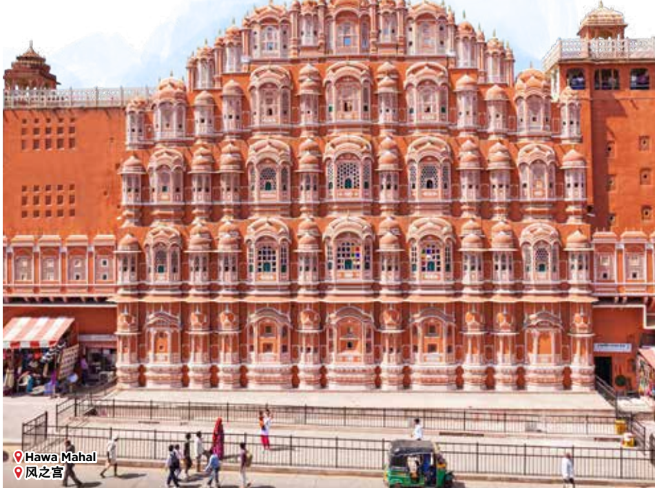
Hawa Mahal 风之宫

体验两晚 传统船屋 体验两晚 住宿 与大自然亲密接触，在宁静的达尔湖风景中感受到家的温馨与舒适。