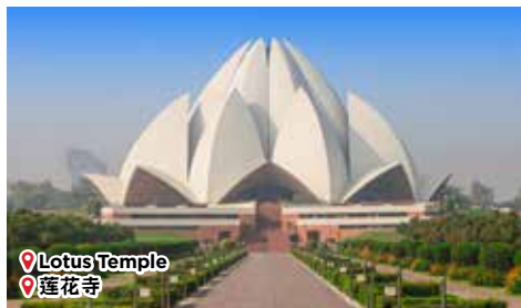
📍 Lotus Temple 📍 莲花寺

Transfer to hotel for check-in and rest.