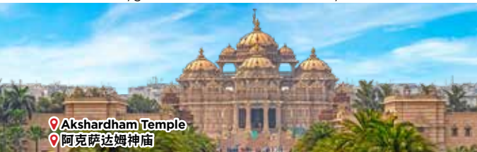
📍 Akshardham Temple 📍 阿克萨达姆神庙

*The Client shall understand that India is a special destination which may be unable to fully provide a comfortable and luxurious experience comparable to developed destinations due to its developing economy, aging infrastructure and harsh natural environment. Nevertheless, we have selected some of the best accommodation and most hygienic restaurants available for your tour of India.