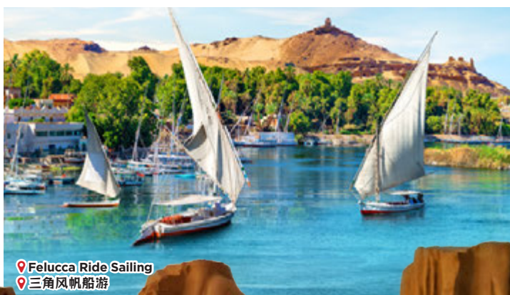
Felucca Ride Sailing 三角风帆船游