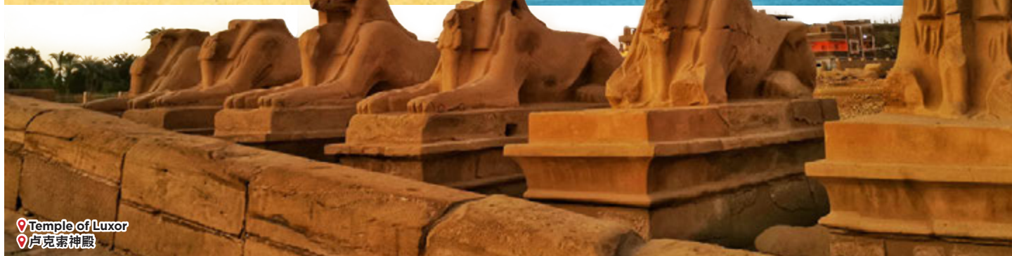
Temple of Luxor 卢克索神殿