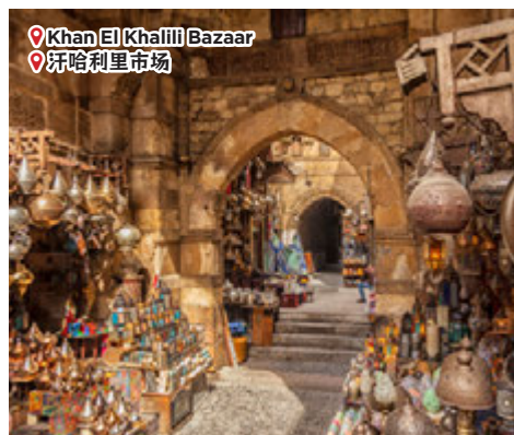
📍 Khan El Khalili Bazaar 📍 汗哈利里市场

下机后安排专车前往阿布辛贝勒。参观两座世界级的古迹——阿布辛贝大神殿（拉美西斯二世神殿）与小神殿（奈菲尔塔瑞王后神殿）位于纳赛尔湖西岸。联合国与埃及政府合力用了4年的时间，将大神殿锯成大石块，搬运到现在的位置。