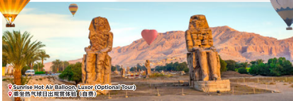
📍 Sunrise Hot Air Balloon, Luxor (Optional Tour) 📍 乘坐热气球日出观赏体验 (自费)