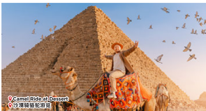
Camel Ride at Desert 沙漠骑骆驼游览