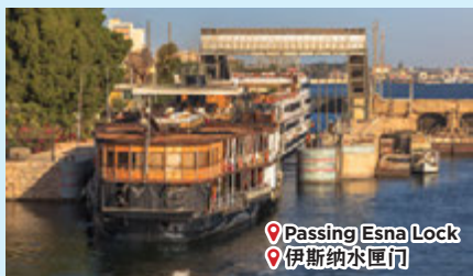
📍 Passing Esna Lock 📍 伊斯纳水闸

In the evening, proceed to east bank of Luxor and Temple of Luxor which by Amenhotep III and Ramses II, it was the largest and most significant religious centre in ancient Egypt.