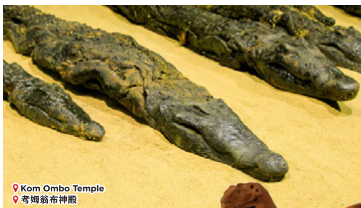
Kom Ombo Temple 考姆翁布神殿