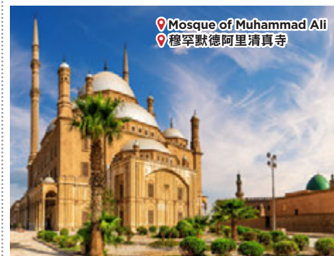
📍 Mosque of Muhammad Ali 📍 穆罕默德阿里清真寺

备注：以下行程仅供与参考。准确行程将以最后确认的航班时间、尼罗河船游与住宿为准。观光行程的序列将会有所更动。