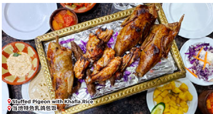
Stuffed Pigeon with Kharfa Rice 当地特色乳鸽包饭