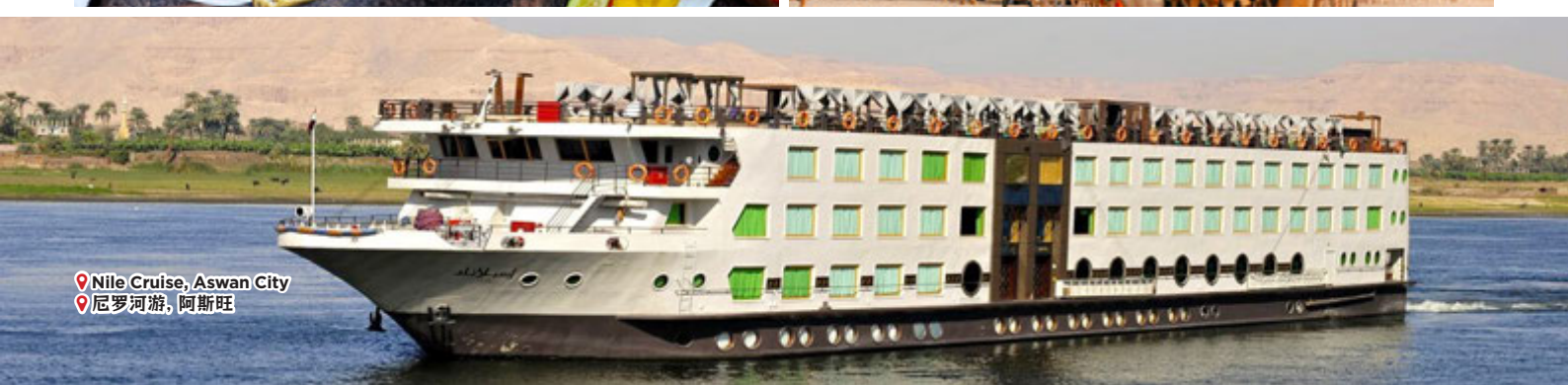
Nile Cruise, Aswan City 尼罗河游, 阿斯旺