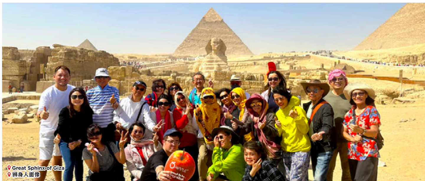
Great Sphinx of Giza 狮身人面像