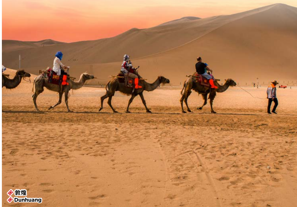
📍 敦煌 Dunhuang