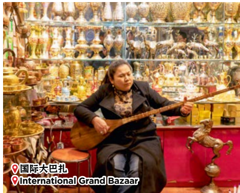
📍 国际大巴扎 📍 International Grand Bazaar