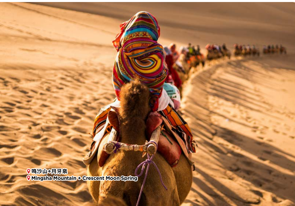
📍 鸣沙山+月牙泉 📍 Mingsha Mountain + Crescent Moon Spring

Transfer to airport for the flight back home.