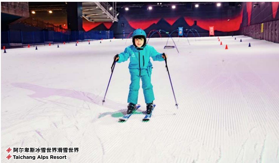
阿尔卑斯冰雪世界滑雪世界 Taichang Alps Resort

Transfer to airport for flight back home.