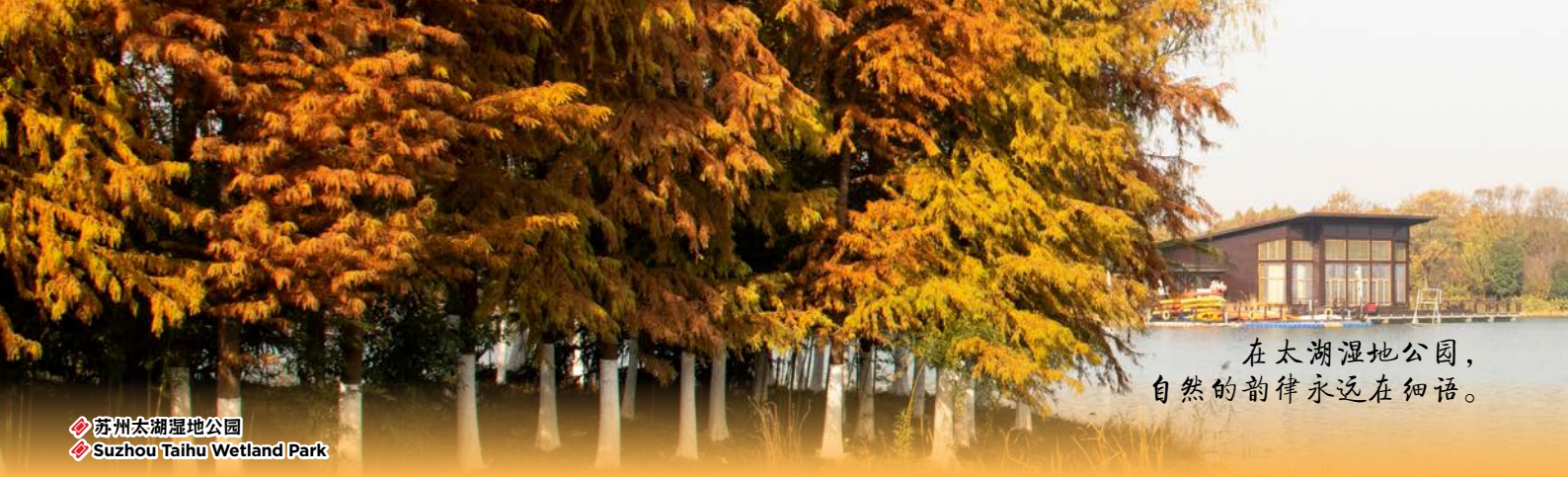
◆ 苏州太湖湿地公园 ◆ Suzhou Taihu Wetland Park