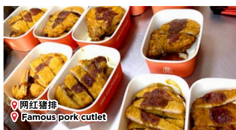
◆ 网红猪排 ◆ Famous pork cutlet

第3天 濮院 -83公里- 苏州 ◆ 苏州太湖湿地公园 国宝大熊猫 首批国家级湿地公园，坐落在“中国刺绣之乡”镇湖。 ◆ 车游金鸡湖 ◆ 诚品书店 中国首家诚品书店。 ◆ 圆融时代广场