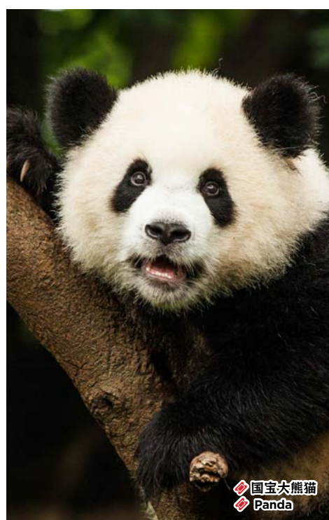
◆ 国宝大熊猫 ◆ Panda