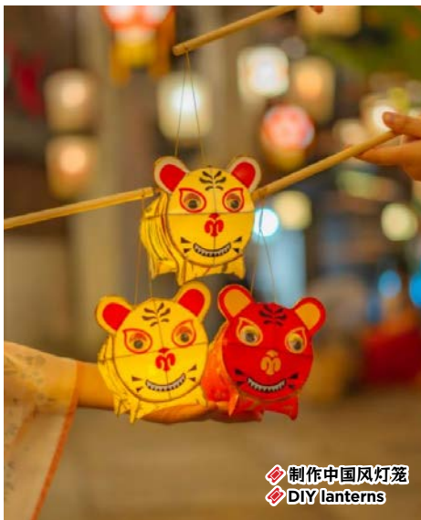
制作中国风灯笼 DIY lanterns