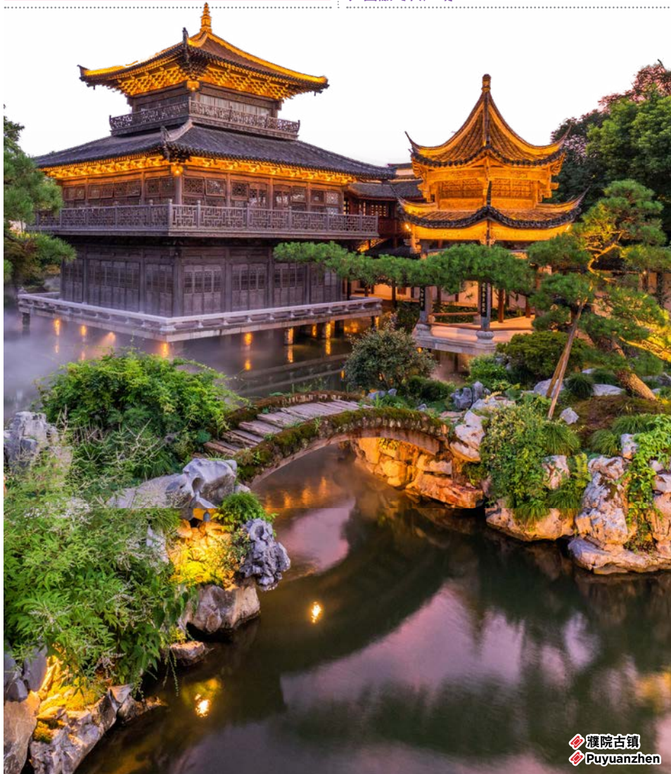
◆ 濮院古镇 ◆ Puyuanzhen

◆ ERA时光之旅表演秀 是中国必看秀之一，将现代科技与中国杂技技术融合在一起。