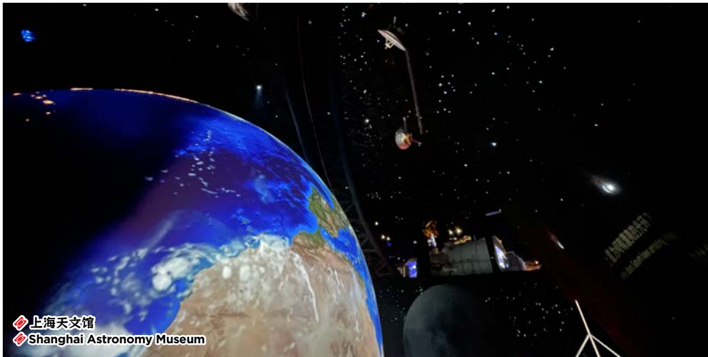
上海天文馆 Shanghai Astronomy Museum