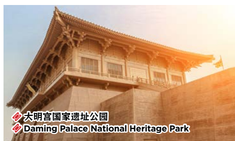
大明宫国家遗址公园 Daming Palace National Heritage Park