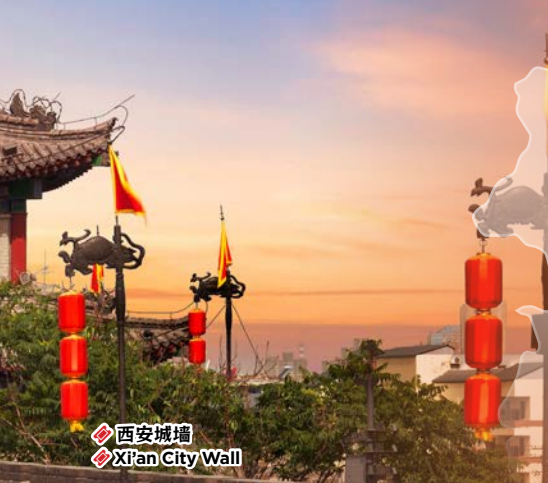
西安城墙 Xi'an City Wall