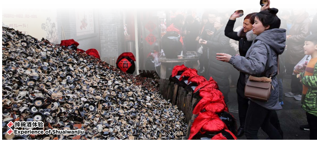
摔碗酒体验 Experience of Shuaiwanjiu