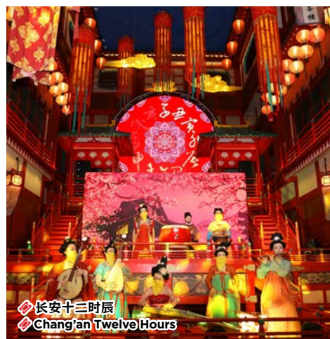
长安十三时辰 Chang'an Twelve Hours