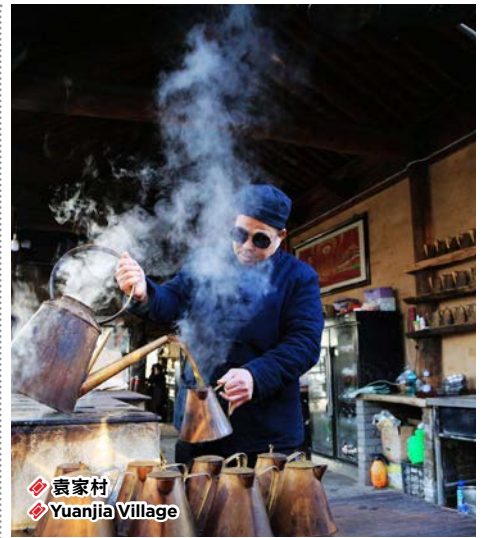
袁家村 Yuanjia Village

永兴坊是中国首个以“非遗文化”为主题的特色街区, 园区汇聚了陕西11地市, 非遗美食和107个街区。