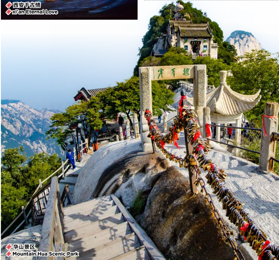
华山景区 Mountain Hua Scenic Park