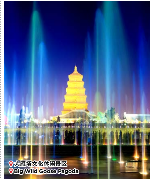
大雁塔文化休闲景区 Big Wild Goose Pagoda