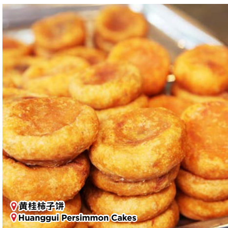
黄桂柿子饼 Huanggui Persimmon Cakes