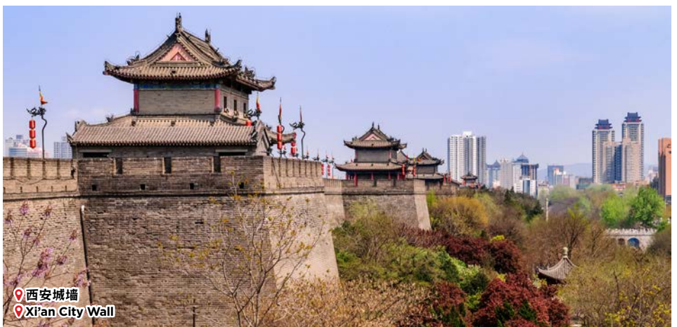
西安城墙 Xi'an City Wall