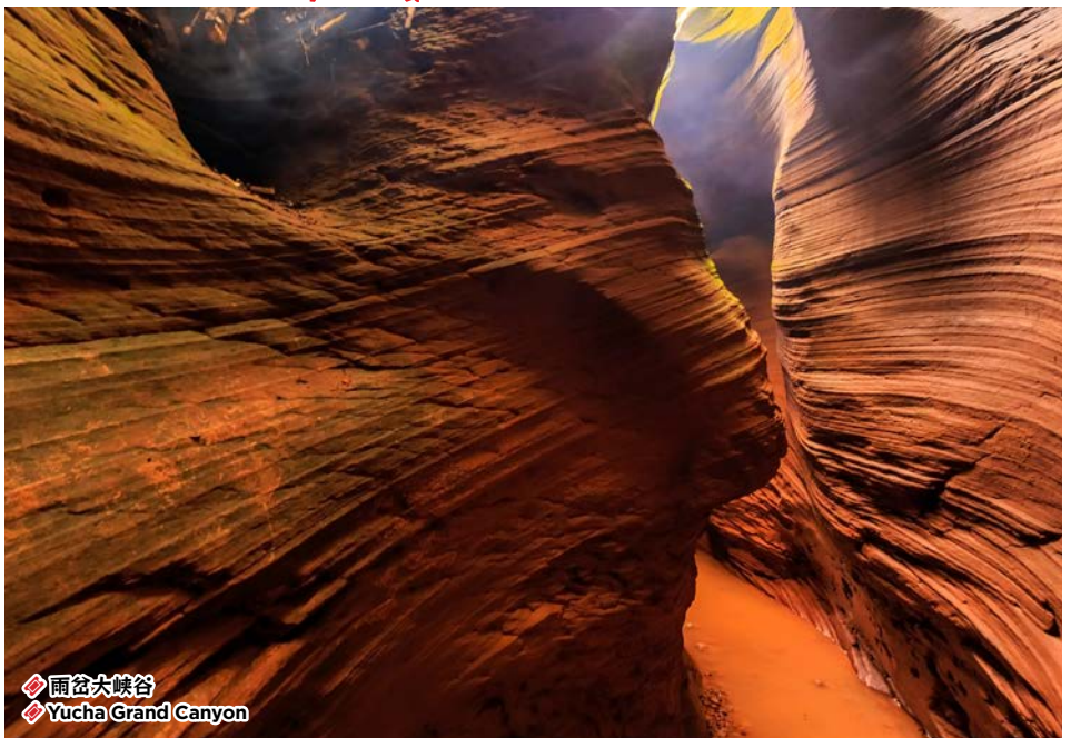
雨岔大峡谷 Yucha Grand Canyon

Northern Shaanxi Province had a strong earthquake, so that one of its loess mountains causing a large crack, and after millions of years of rainfall, slowly formed the Yucha Grand Canyon.