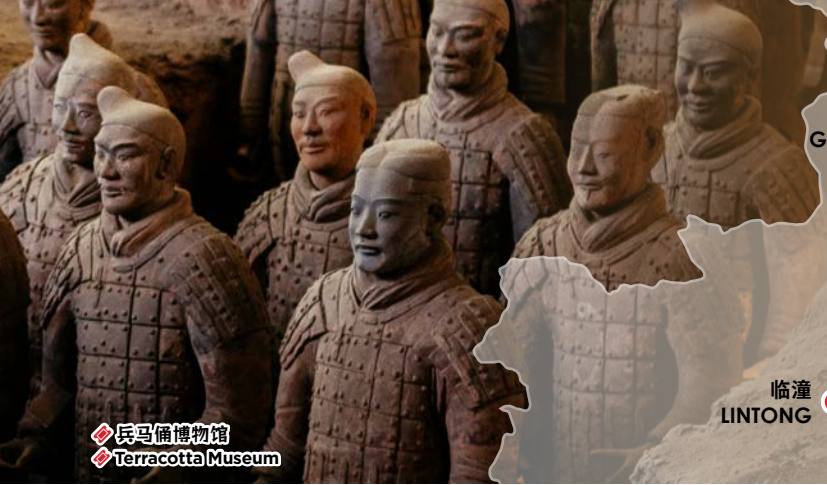
兵马俑博物馆 Terracotta Museum