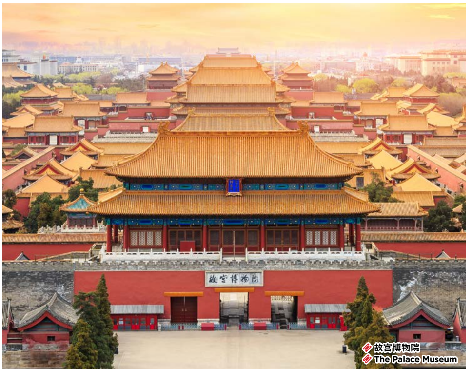
故宫博物院 The Palace Museum