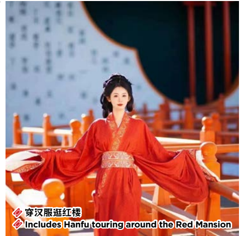
穿汉服逛红楼 Includes Hanfu touring around the Red Mansion