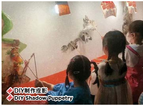
DIY制作皮影 DIY Shadow Puppetry

皮影戏是中国一项重要的非物质文化遗产，蕴含着中华民族特有的精神价值、思维方式和文化意识。