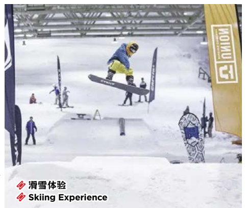
滑雪体验 Skiing Experience

Transfer to airport for flight back home.