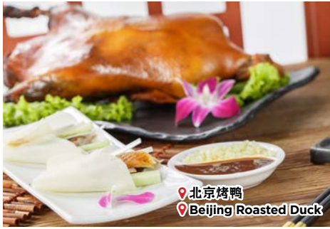
北京烤鸭 Beijing Roasted Duck

颐和园是北京众多湖泊，花园和宫殿的集合体。这是清代的皇家园林。主要由长寿山和昆明湖主导，它占地2.9平方公里，其中四分之三是水。