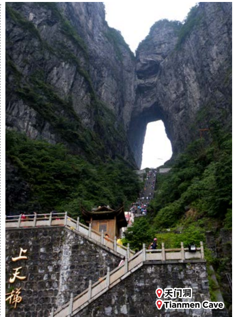
天门洞 Tianmen Cave

※冬季（12月-2月）天门洞、环保车、电梯都会关闭停运，团队只能远眺（视天气而定）而不游览天门洞部分，并乘坐缆车往返。