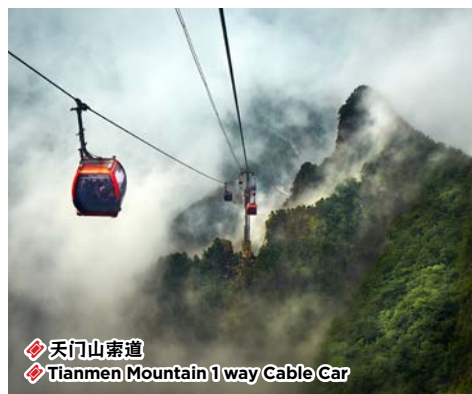
天门山索道 Tianmen Mountain 1 way Cable Car