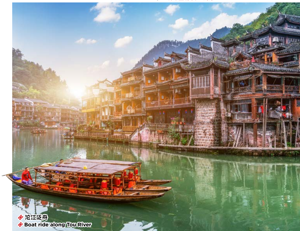
沱江泛舟 Boat ride along Toudou River