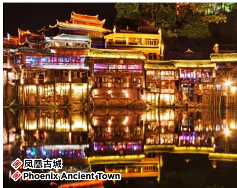
凤凰古城 Phoenix Ancient Town