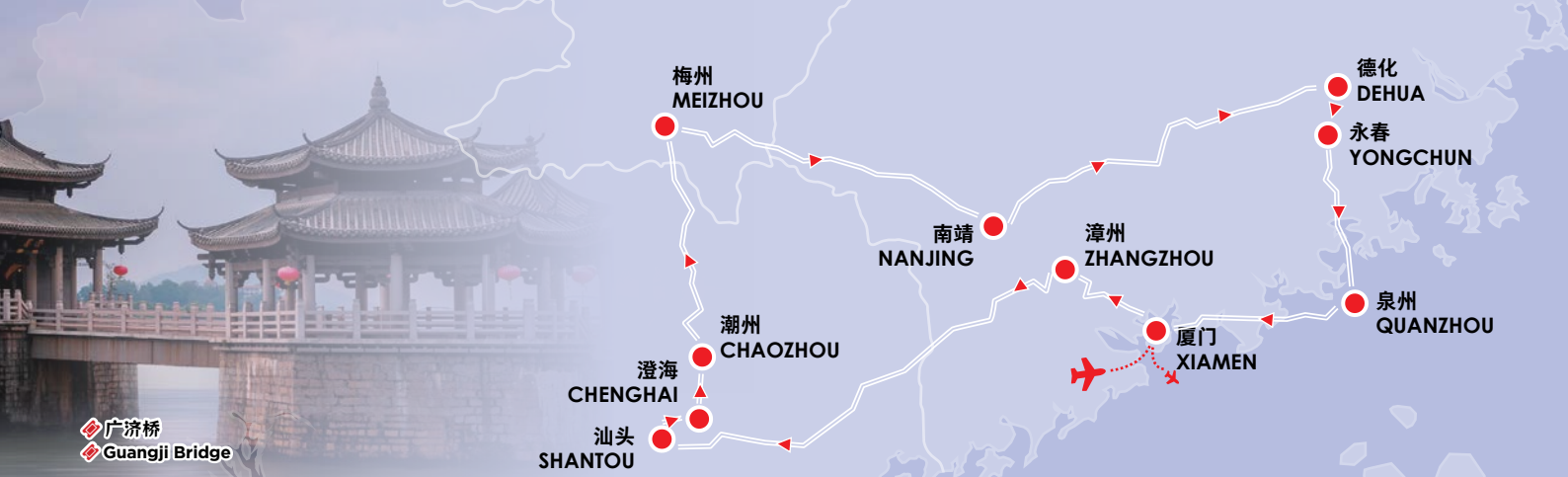
广济桥 Guangji Bridge