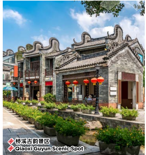
桥溪古韵景区 Qiaoxi Guyun Scenic Spot

📍 Shunmei Ceramics Pavilion Experience the charm of Dehua ceramics but also showcase the rich history of Dehua ceramic culture and the current state of modern ceramic development.