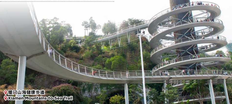
厦门山海健康步道 Xiamen Mountains-to-Sea Trail