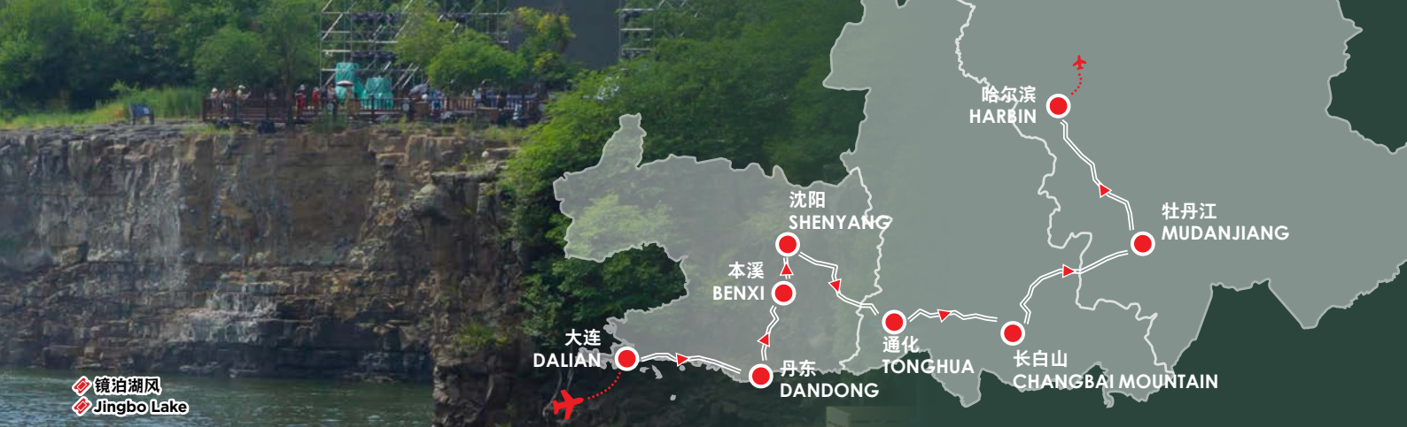
镜泊湖风 Jingbo Lake