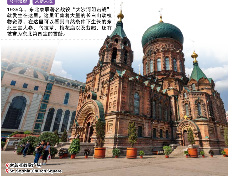
📍 索菲亚教堂广场 📍 St. Sophia Church Square