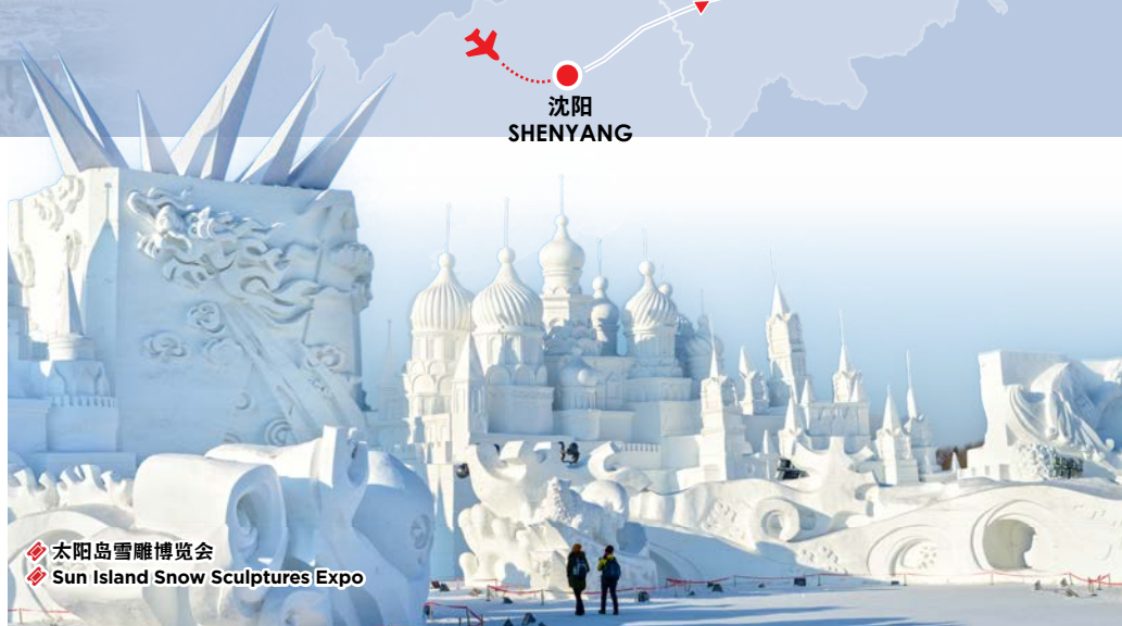
太阳岛雪雕博览会 Sun Island Snow Sculptures Expo