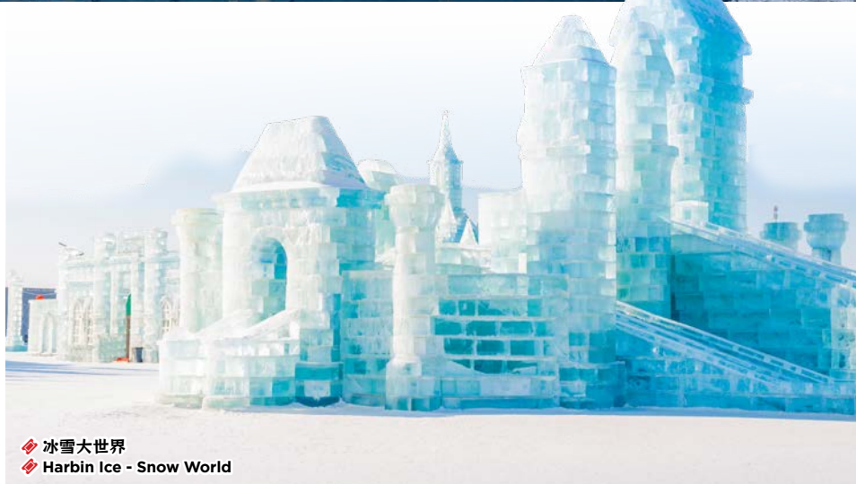
📍 冰雪大世界 📍 Harbin Ice - Snow World