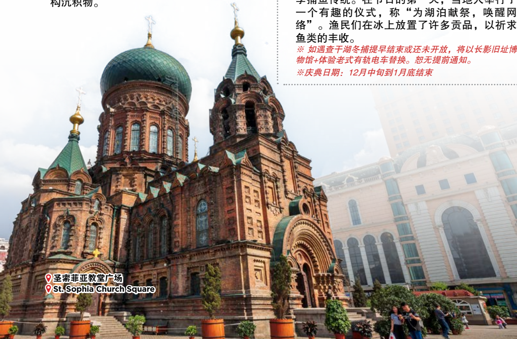
📍 圣索菲亚教堂广场 📍 St.Sophia Church Square

雾凇，其实也是霜的一种，是由冰晶在温度低于冰点以下的物体上形成的白色不透明粒状结构沉积物。