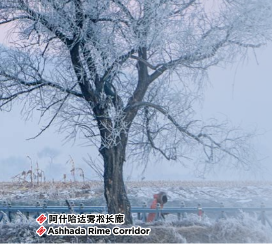
阿什哈达雾凇长廊 Ashhada Rime Corridor