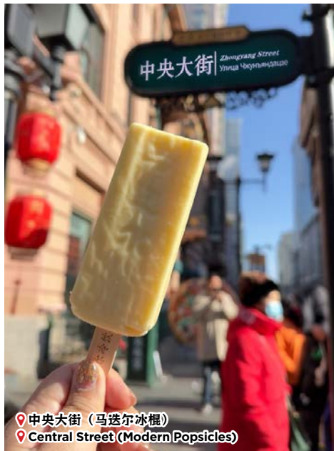
中央大街 (马迭尔冰棍) Central Street (Modern Popsicles)

This is not only a living space, but also a key site for political and military decision-making in Northeast China at the time.