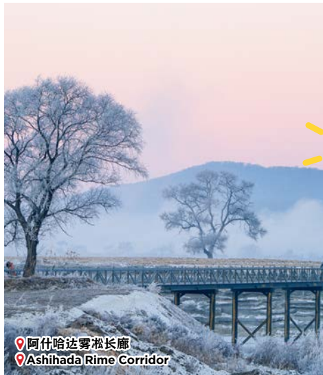
阿什哈达雾凇长廊 Ashihada Rime Corridor