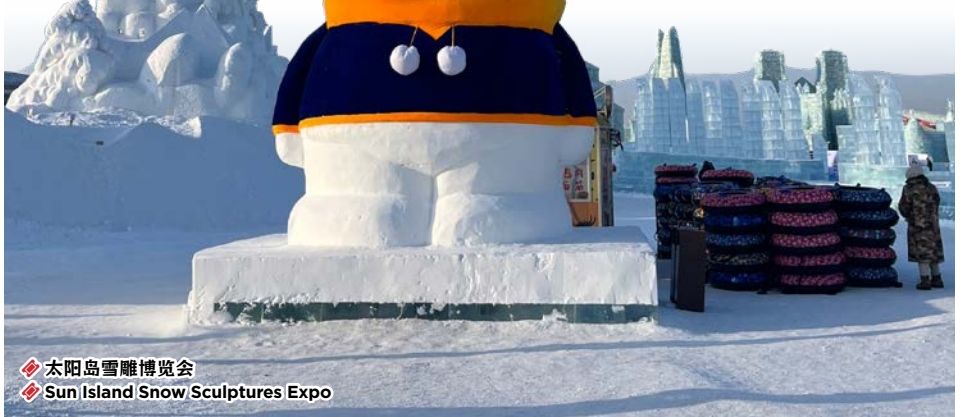
太阳岛雪雕博览会 Sun Island Snow Sculptures Expo

一年一度的雪博会展览持续约2个月，期间您可以欣赏到由中外艺术家制作的各种大型雪雕。这些雪雕精致而富有艺术感。创作这些雪雕的艺术家来自许多国家。雪博会也是国际和国内雪雕比赛的场地。参观者有机会看到艺术家的现场制作过程以及他们完成的杰出作品。