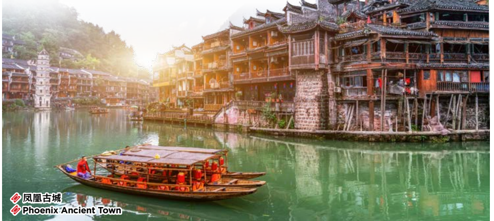
◆ 凤凰古城 ◆ Phoenix Ancient Town

DAY 3 CHANGDE -282KM- PHOENIX ◆ Phoenix Ancient Town Includes Ticket Market price RMB148 Boat ride along Tou River Hongqiao Art Centre Stilted Building Of Tujia Nationality Night view of the Ancient Town Phoenix is a beautiful town in China, famous for its natural beauty, rich history, ethnic customs, and night scenery.