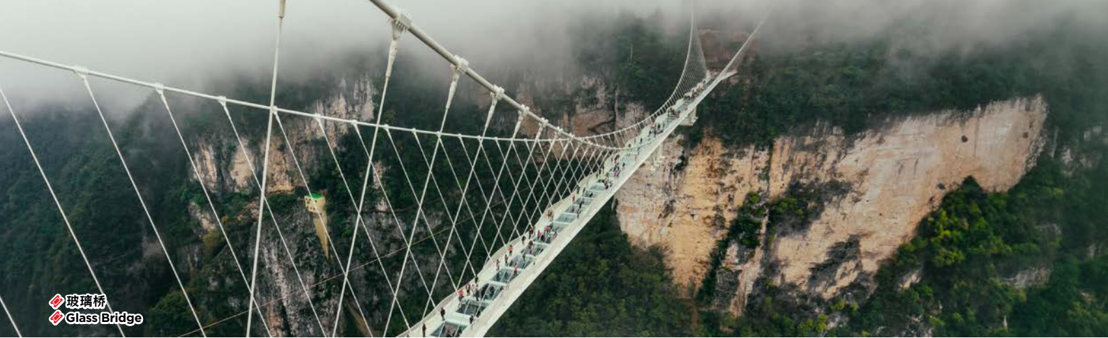
玻璃桥 Glass Bridge