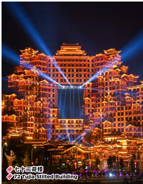
七十二奇楼 72 Tujia Stilted Building