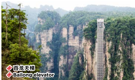
◆ 百龙天梯 ◆ Bailong elevator

◆ Mount Tianmen Fox Fairy Show A stunning outdoor performance using landscapes of the Zhangjiajie mountains. ※Show will be replace to Charming Xiangxi for group departure or arrival date on 08 Dec to 08 Mar or any unforeseen circumstances.