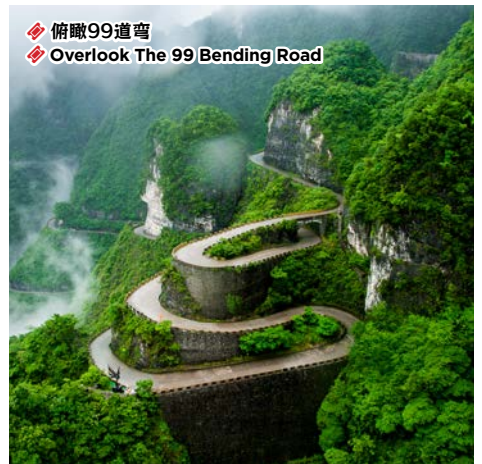
◆ 俯瞰99道弯 ◆ Overlook The 99 Bending Road

DAY 8 ZHANGJIAJIE -321KM- CHANGSHA ✕ KUALA LUMPUR ◆ Huangxing Shopping Street Includes Instagrammable Drink Transfer to airport for flight back home.