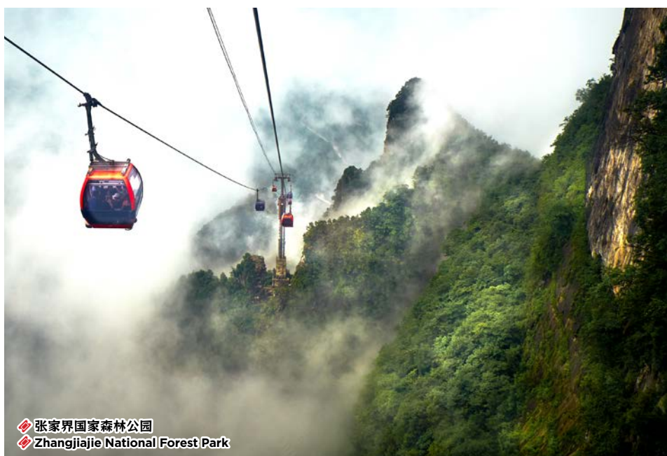
张家界国家森林公园 Zhangjiajie National Forest Park