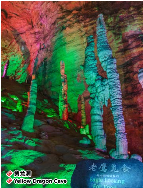
黄龙洞 Yellow Dragon Cave