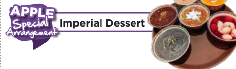
APPLE Special Arrangement Imperial Dessert

An imperial complex of religious buildings situated in the southeastern part of central Beijing. The complex was visited by the Emperors of the Ming and Qing dynasties for annual ceremonies of prayer to Heaven for good harvest.