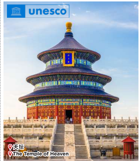
天坛 The Temple of Heaven

◆ "Golden Mask Dynasty" Show ◆ Taikoo Li Sanlitun