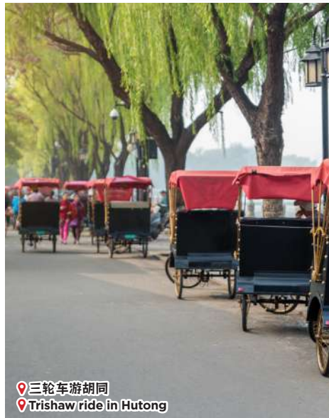
三輪車游胡同 Trishaw ride in Hutong