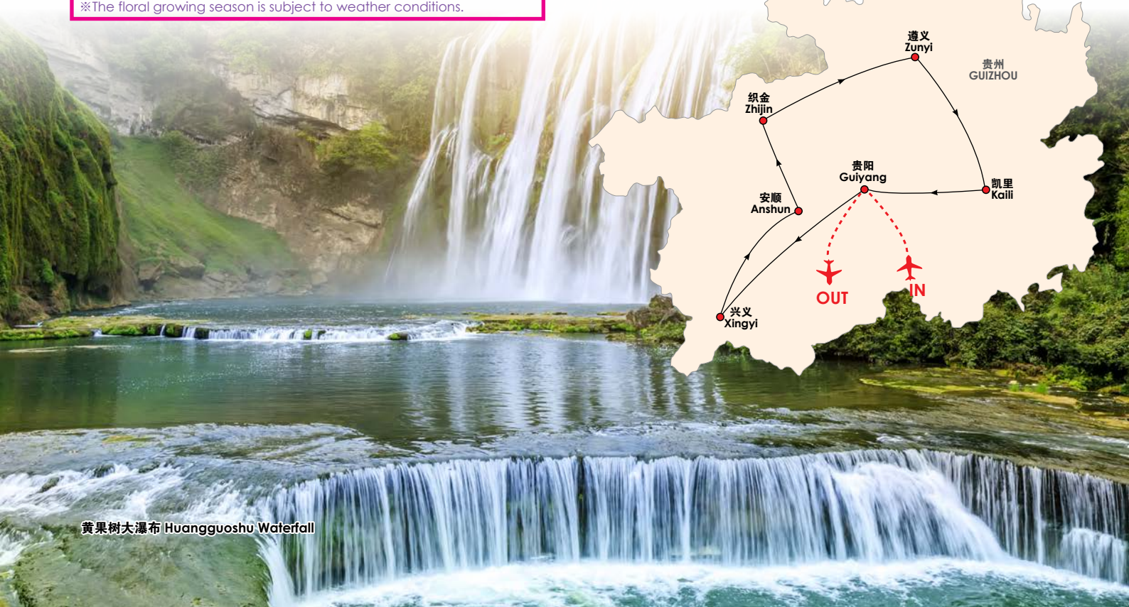
黄果树大瀑布 Huangguoshu Waterfall