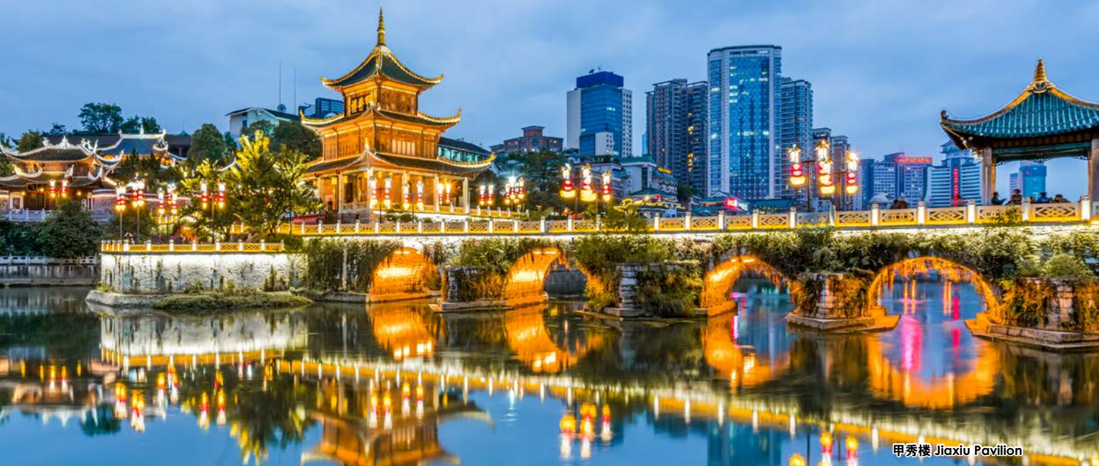
甲秀楼 Jiaxiu Pavilion