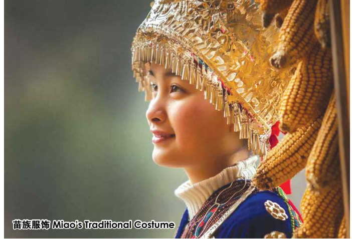
苗族服饰 (Miao's Traditional Costume)

A Bite of China: Xinyi Fengling Egg Fried Rice