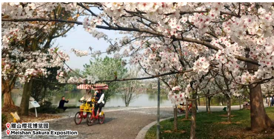
📍 眉山樱花博览园 📍 Meishan Sakura Exposition