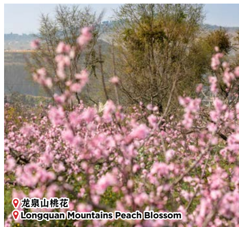
📍 龙泉山桃花 📍 Longquan Mountains Peach Blossom