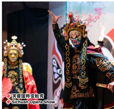
📍 芙蓉国粹变脸秀 📍 Sichuan Opera Show

川剧的一种，打破传统戏曲演出的套路，围绕川剧精髓—变脸，上演一出有故事、有情节的精彩剧目。