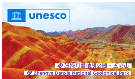
◆ 张掖丹霞地质公园 - 五彩山 ◆ Zhangye Danxia National Geological Park

令人难以置信的彩色“五彩”看起来像一个外星球的表面。五彩山于2010年成为联合国教科文组织世界遗产。