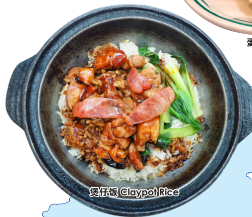
煲仔饭 Claypot Rice