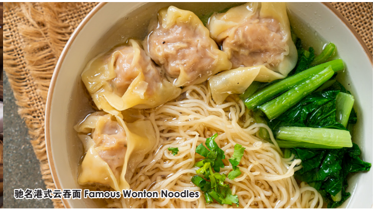
驰名港式云吞面 Famous Wonton Noodles