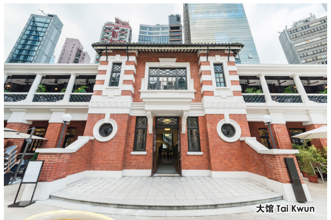
大馆 Tai Kwun