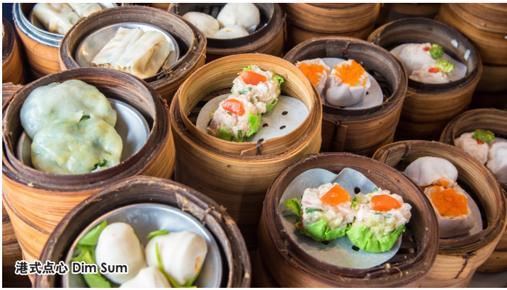
港式点心 Dim Sum