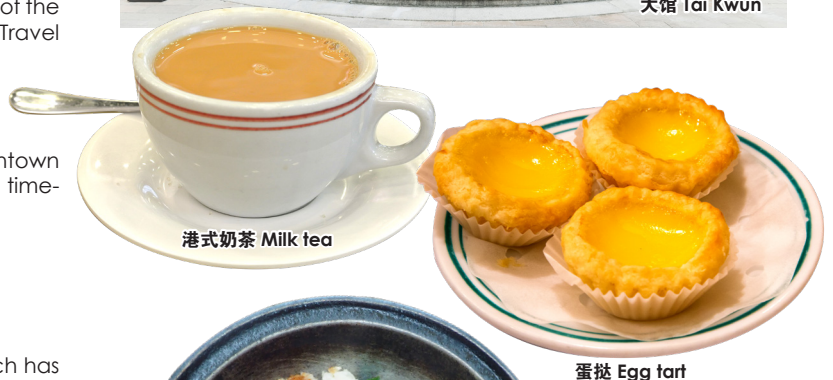
港式奶茶 Milk tea