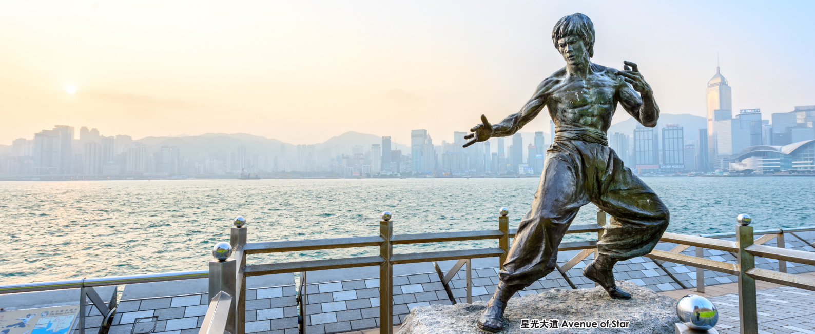
星光大道 Avenue of Star