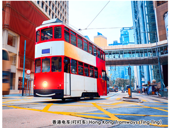
香港电车(叮叮车) Hong Kong Tramways (Ting Ting)

※Sequence of the itinerary is subject to change according to the final flight confirmation