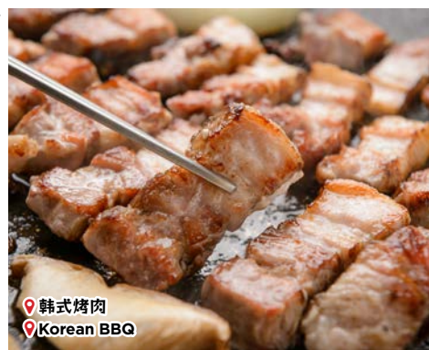
◆ 韩式烤肉 ◆ Korean BBQ

乡校是韩国昔日的教育机构，拥有百年树龄的银杏树，每到秋天都会展现出独特而令人惊叹的美景。