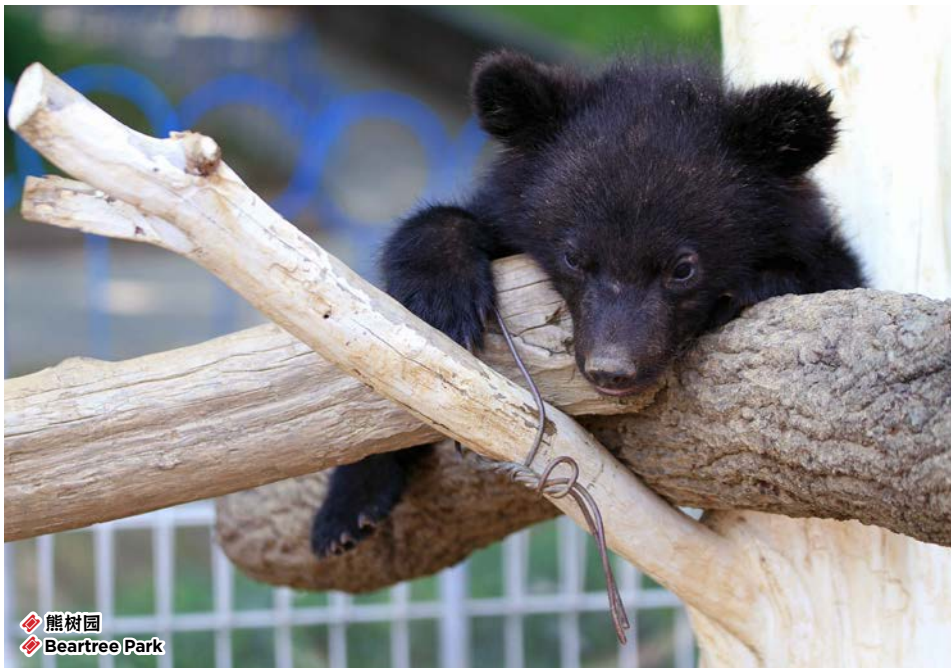
◆ 熊树园 ◆ Beartree Park