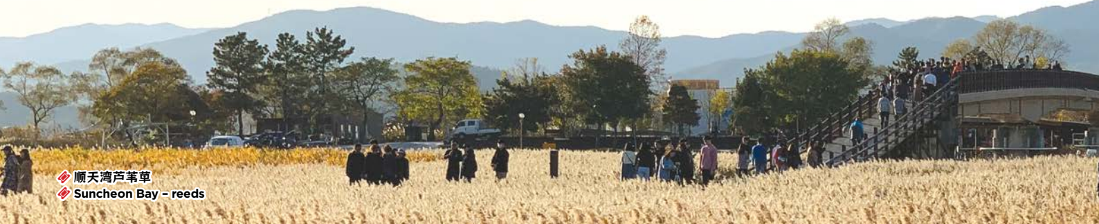
◆ 顺天湾芦苇草 ◆ Suncheon Bay - reeds