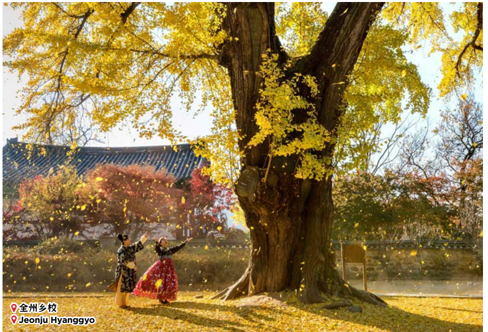
📍 全州乡校 📍 Jeonju Hyanggyo