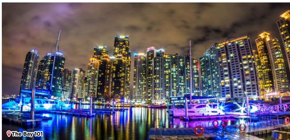
📍 The Bay 101

Transfer to airport for flight back home.