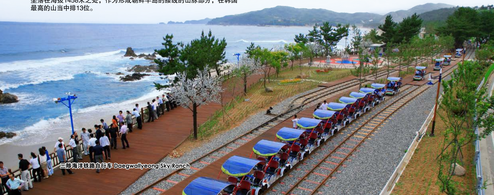
三陟海洋铁路自行车 Daegwallyeong Sky Ranch