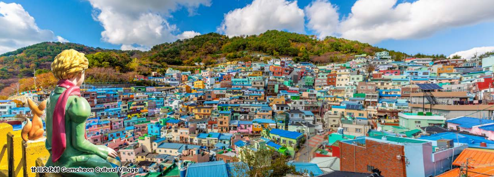
甘川文化村 Gamcheon Cultural Village

※ 节日举办日期将取决于当地安排，如有变更，恕不另行通知。 符号表示：★ 含门票；◎ 游览站点