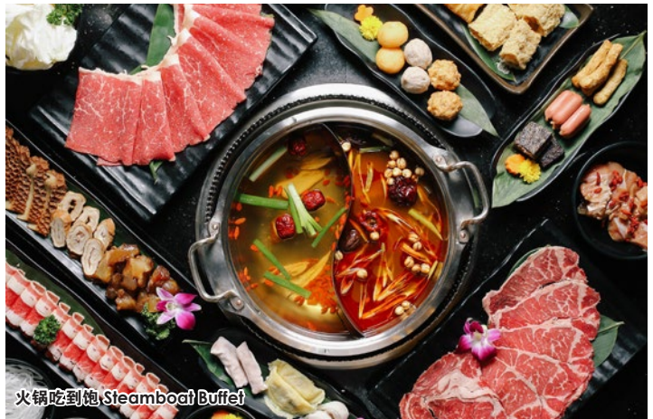
火锅吃到饱 Steamboat Buffet