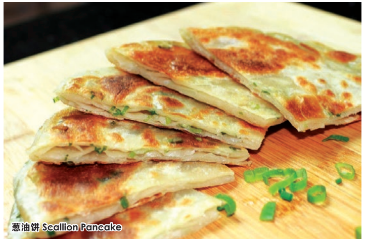
葱油饼 Scallion Pancake

Extraordinary - Reminiscence Cuisine Celebrated Roast Duck - Cherry Duck Cuisine Taiwan Must Eat - Steamboat Buffet