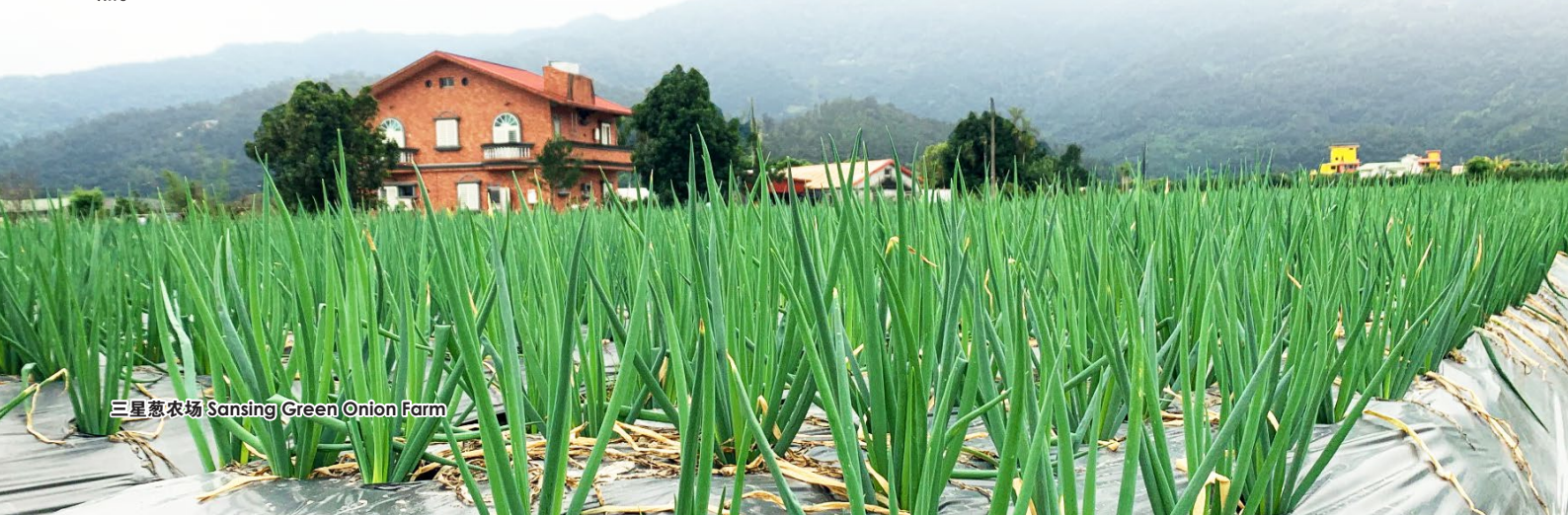
三星葱农场 Sansing Green Onion Farm