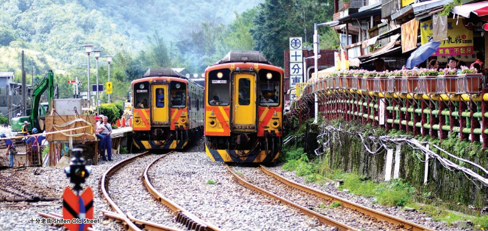
十分老街 Shifen Old Street