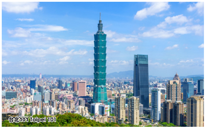
台北101 Taipei 101