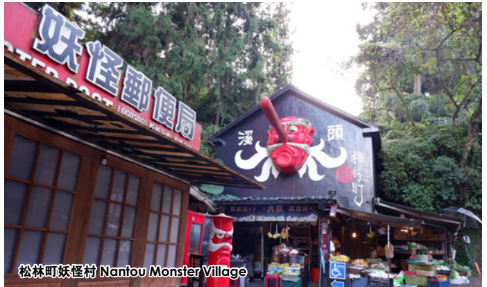
松林町妖怪村 Nantou Monster Village