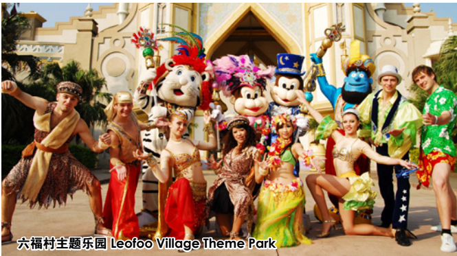
六福村主题乐园 Lefoo Village Theme Park

Cute Japanese monster statues are all over this small village and red lanterns hang on the eaves, making it a brilliant place for photography.