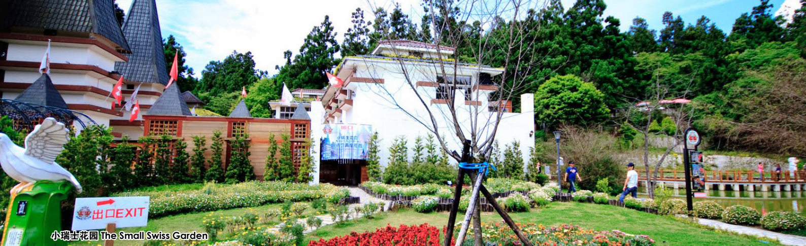
小瑞士花园 The Small Swiss Garden