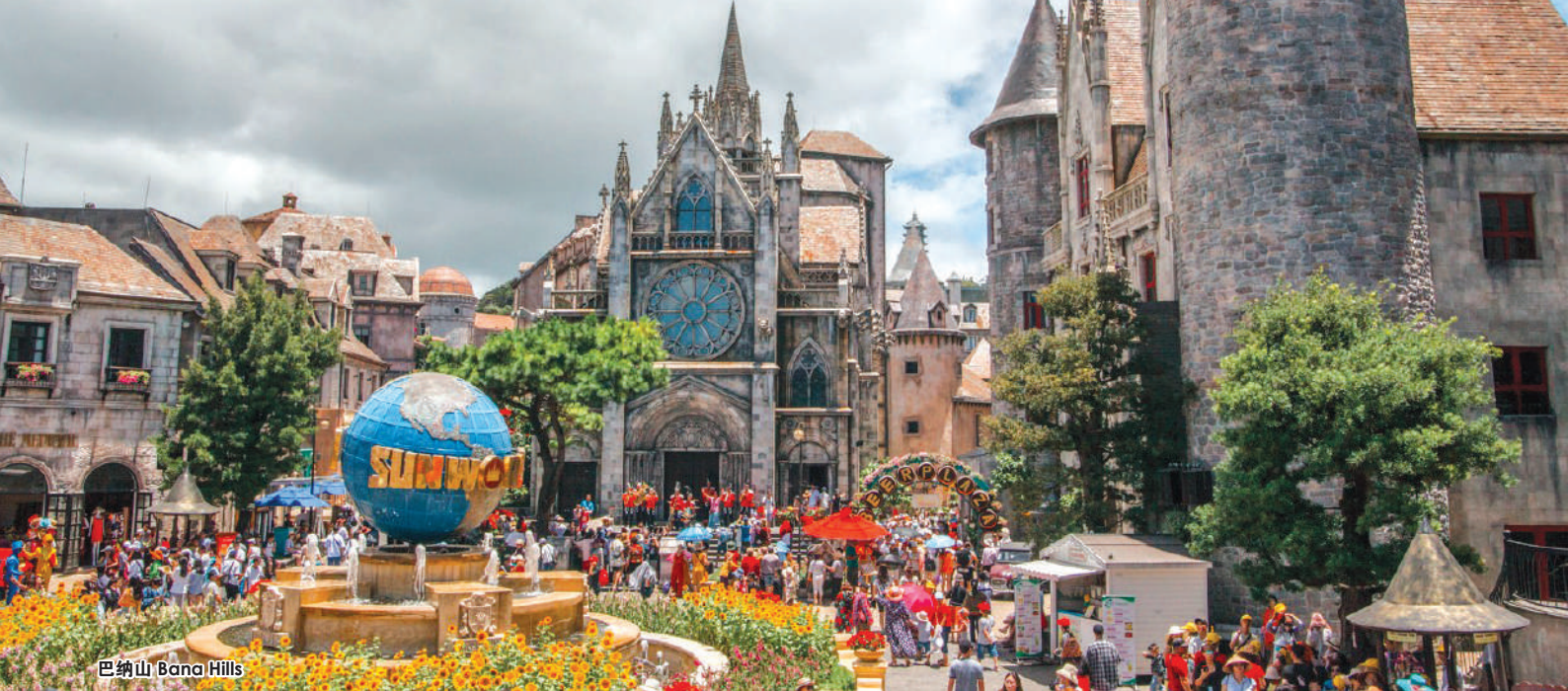
巴纳山 Bana Hills