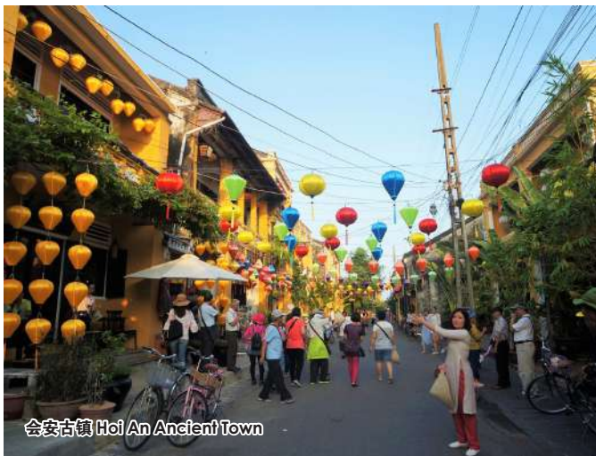
会安古镇 Hoi An Ancient Town