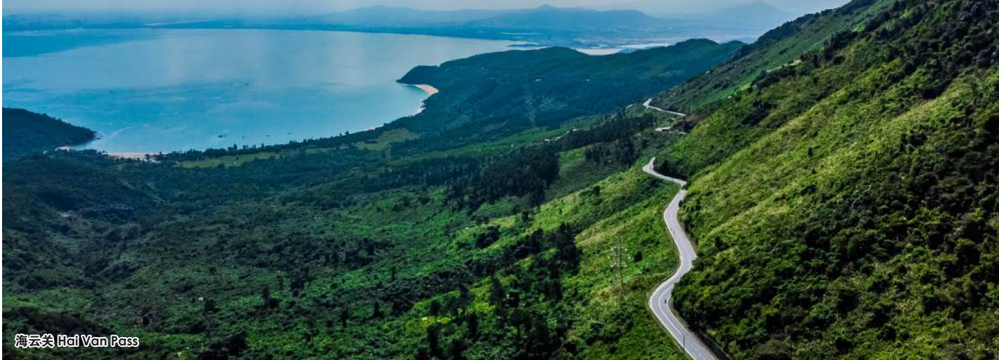
海云关 Hai Van Pass