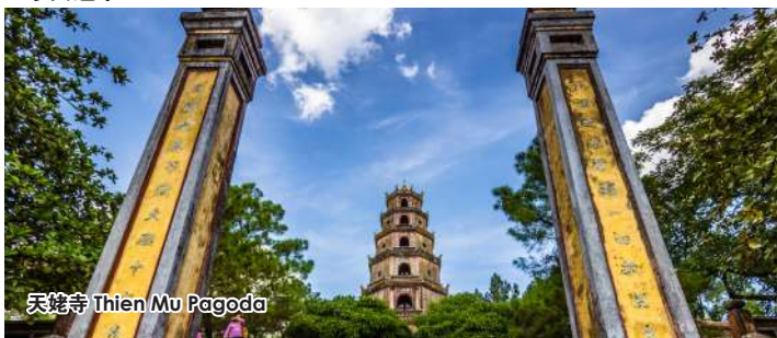
天姥寺 Thien Mu Pagoda